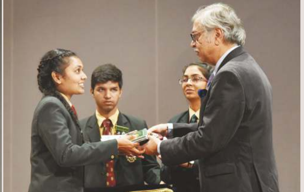
Cultural Cup: Bhoroli-Lohit