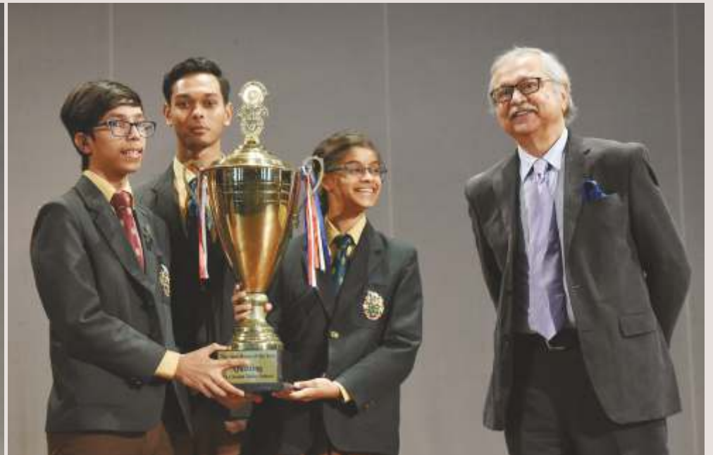
Quiz Cup: Bhoroli-Lohit