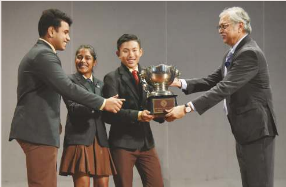
Sports Cup: Bhoroli-Lohit