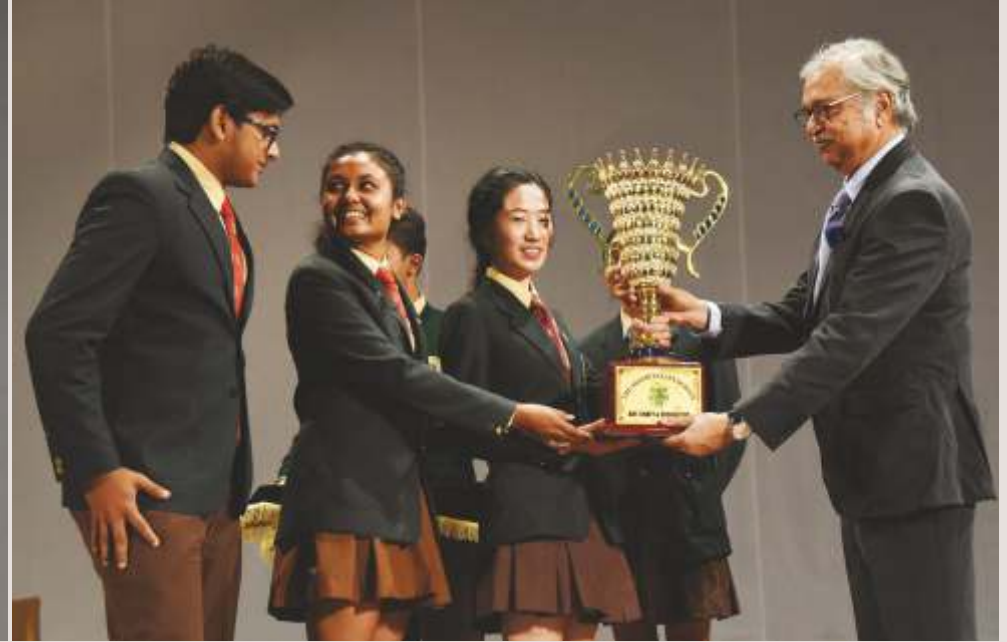
Art, Craft & Design Cup: Bhoroli-Lohit