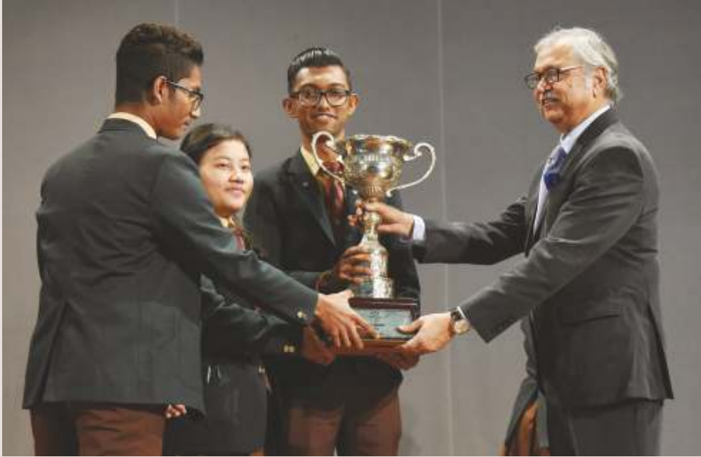
Fair-Play Cup: Jinari-Manas