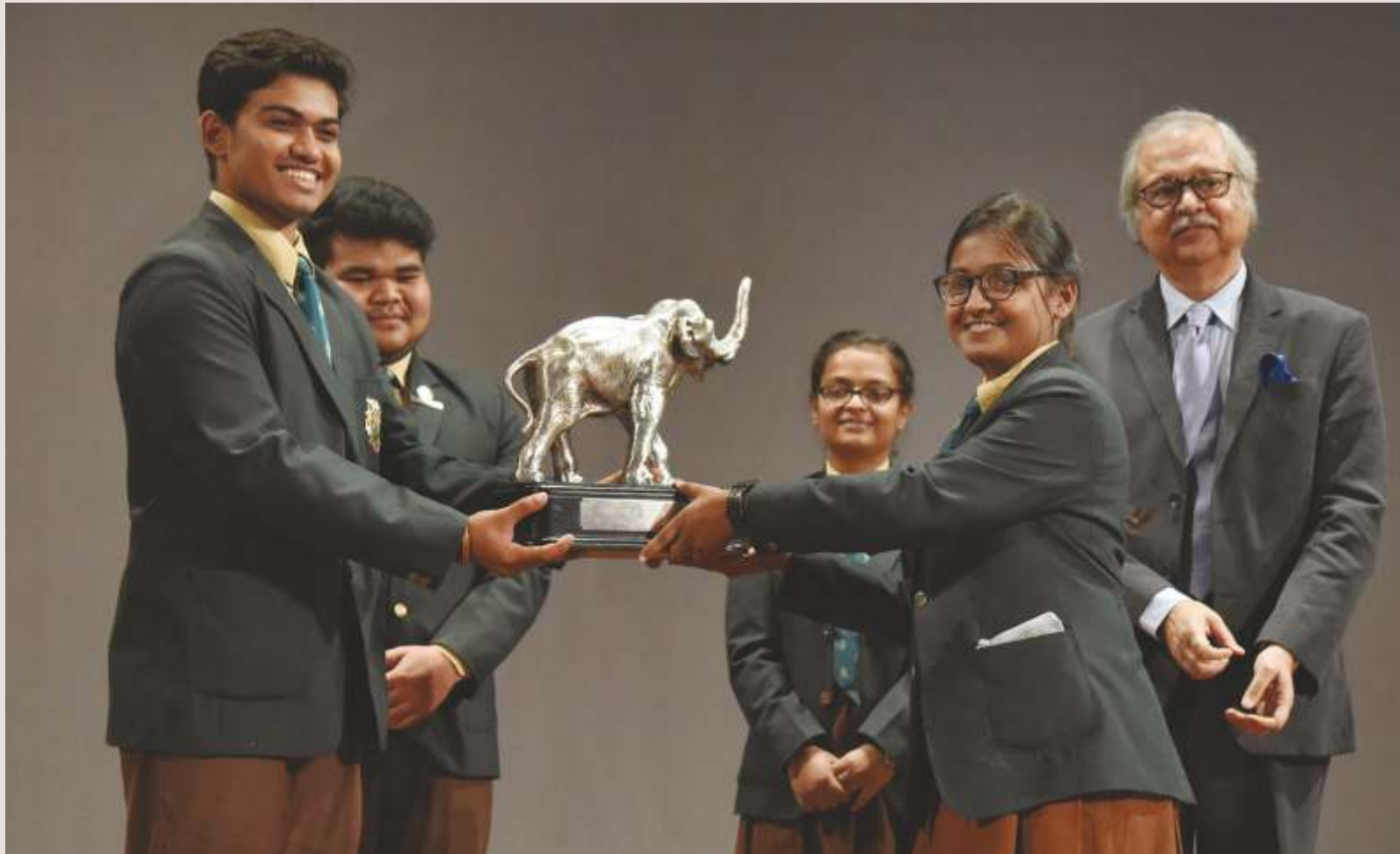
R. B. Magor Trophy: 2016-2017 : Jinari-Manas