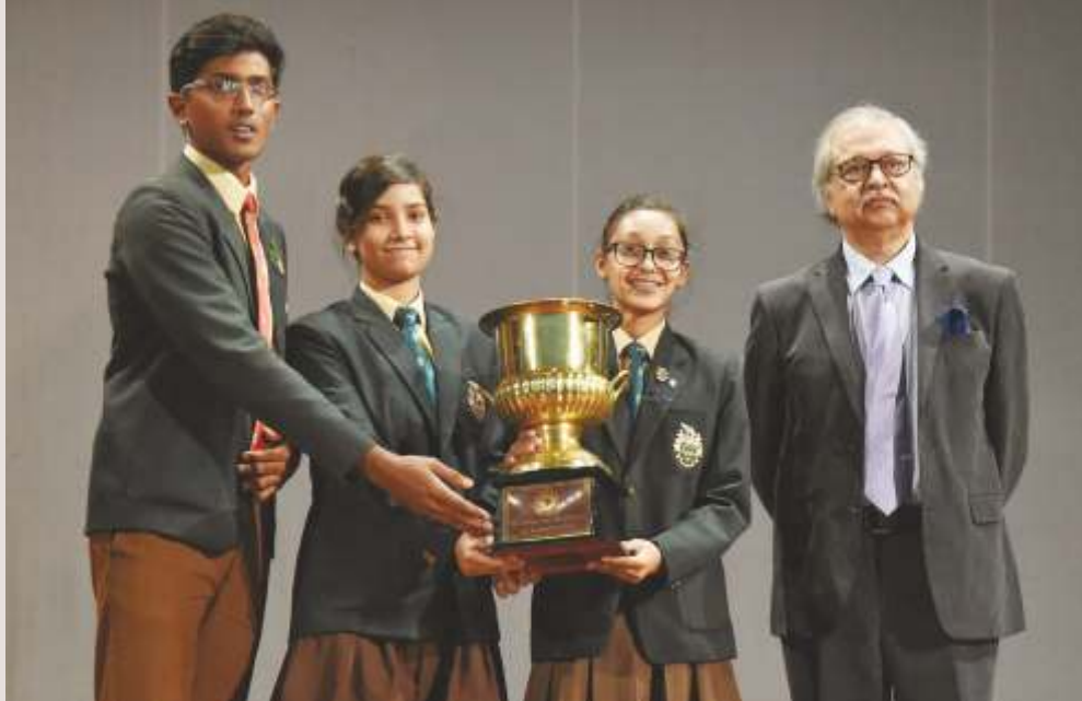
Academics Cup: Bhoroli-Lohit