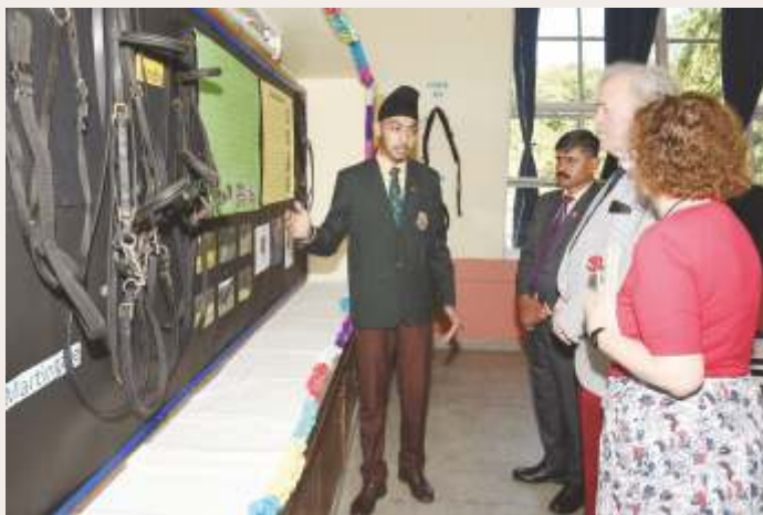
An exhibition showcasing horse care, grooming and food habits of the animals along with AVS's achievements in this field.