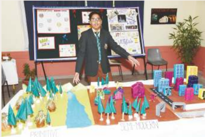
An interesting exhibition that presented man's transition from primitive to modern society.