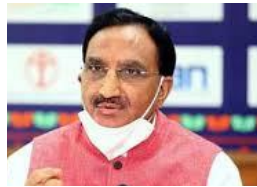
Ramesh Pokhriyal, Minister of Education