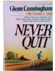
His book titled 'Never Quit'