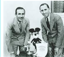
Walt Disney and his brother, Roy O. Disney