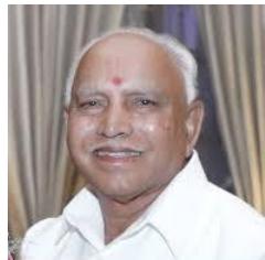
Karnataka CM B. S. Yediyurappa