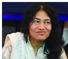
Irom Chanu Sharmila, an activist demanding the withdrawal of AFSPA in Manipur.