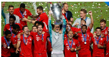
FC Bayern Munich