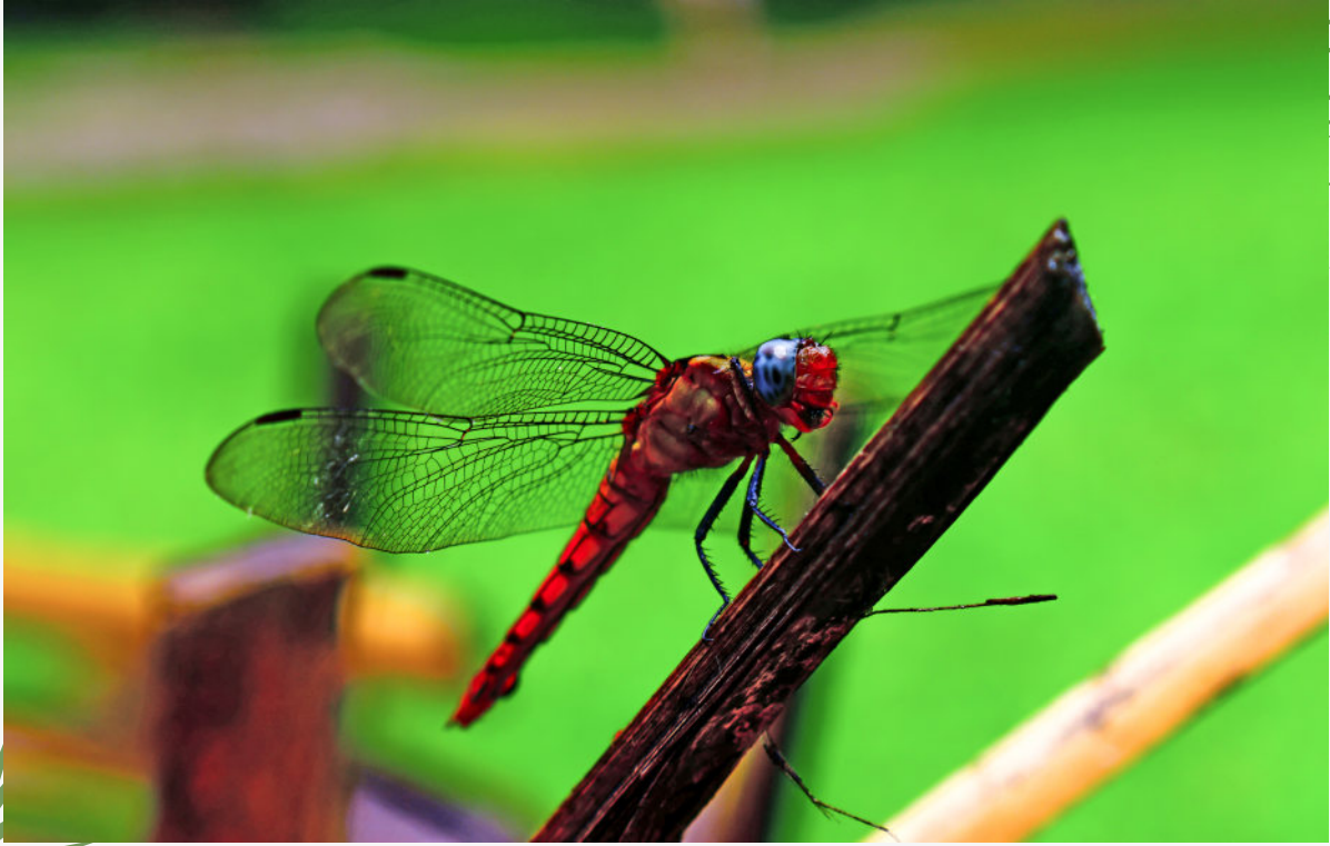
Photographer: Rayyan Hazarika, Class 10 Place: Bangalore | Nikon D3400 (f/8, 1/250 & ISO 180)