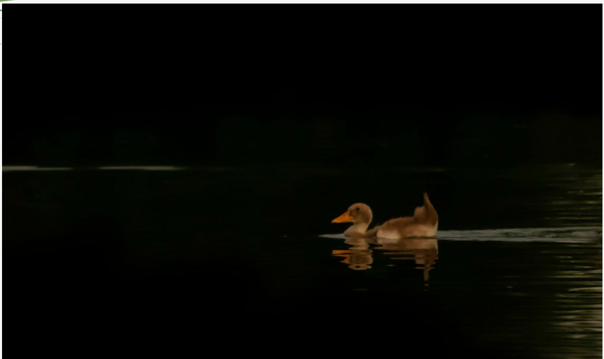
Photographer: Deep Kanoi , Class 12 Place: Guwahati | NIKON D3400 (f/6.3, 1/2500 ISO 800)