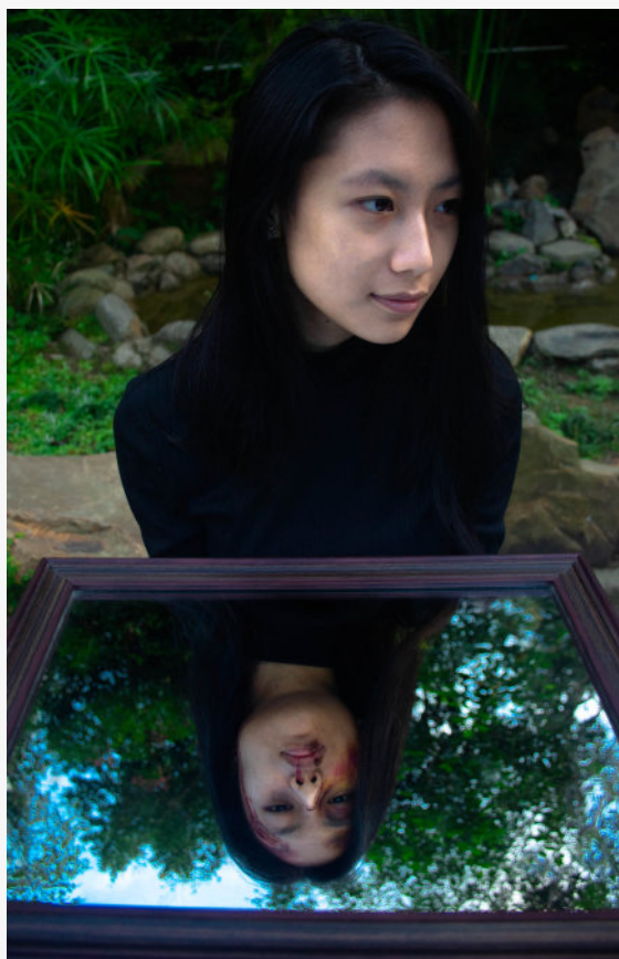
Place: Nagaland | NIKON D5600 (f/5.6, 1/250 & ISO: 300)