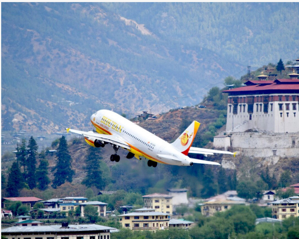
Place: Paro, Bhutan | Nikon D3300 ( f/7.1, 1/500 & ISO 200)