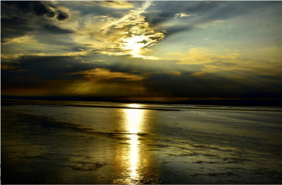
Place: Tezpur | Nikon D3100 (f/8, 1/60 & ISO 400)