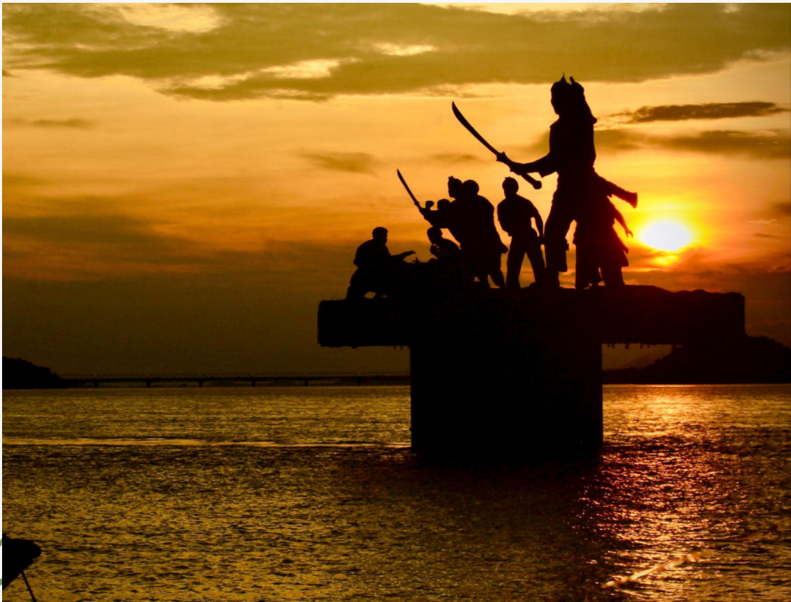
Photographer: Dhruvad Choudhary, Class 12 Place: Guwahati | Canon EOS 1300D (f/16, 1/200 ISO 100)