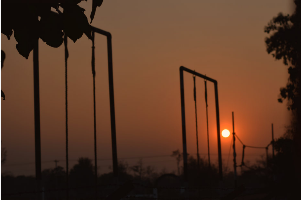
Place: Tinsukia, Assam | Nikon D3100 (f/8, 1/60 & ISO 400)