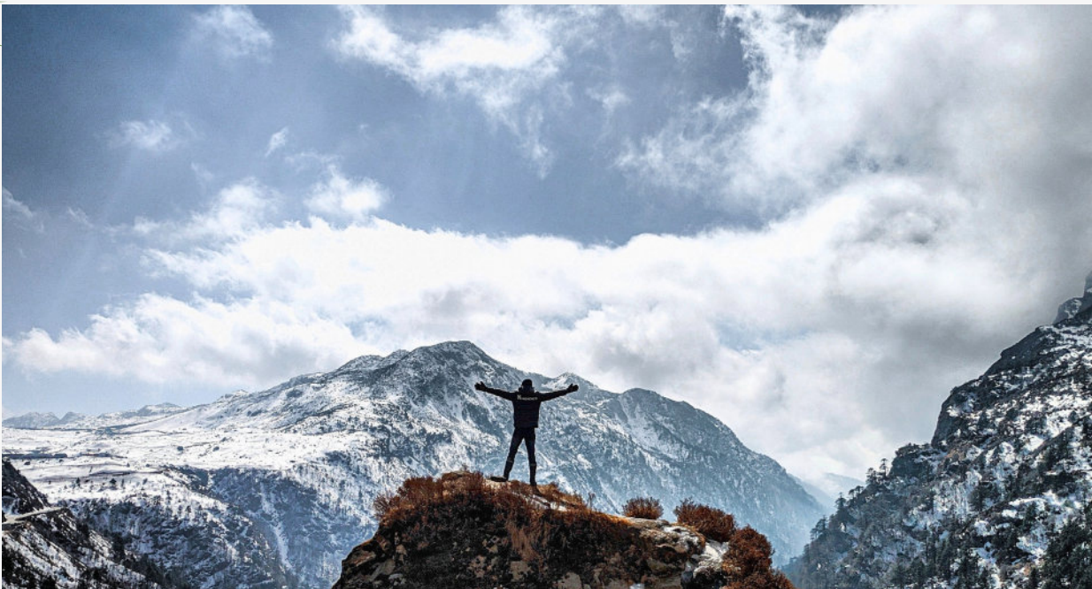
Place: Uttarakhand | Nikon D5300 (f/7, 1/125 & ISO: 400)