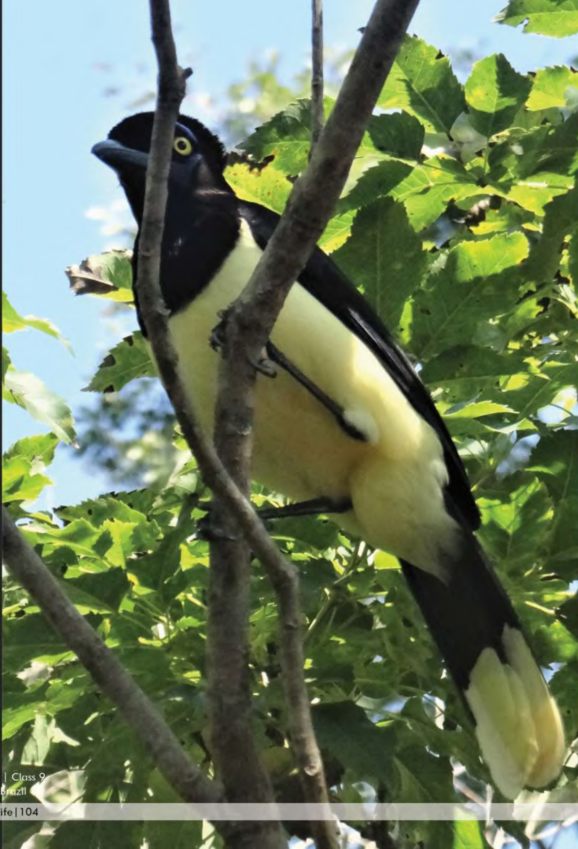
TAMISHKA SHARMA | Class 9 PHOTO LOCATION: Brazil