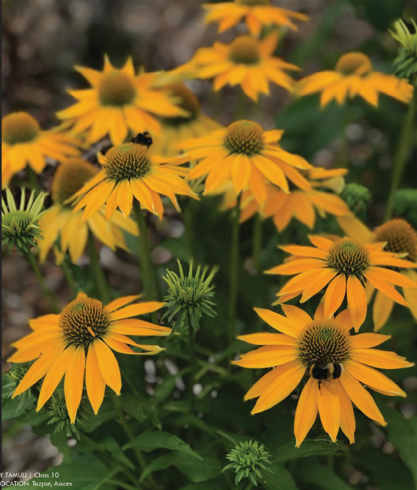
CHINMOY TAMULI | Class 10 PHOTO LOCATION: Tezpur, Assam