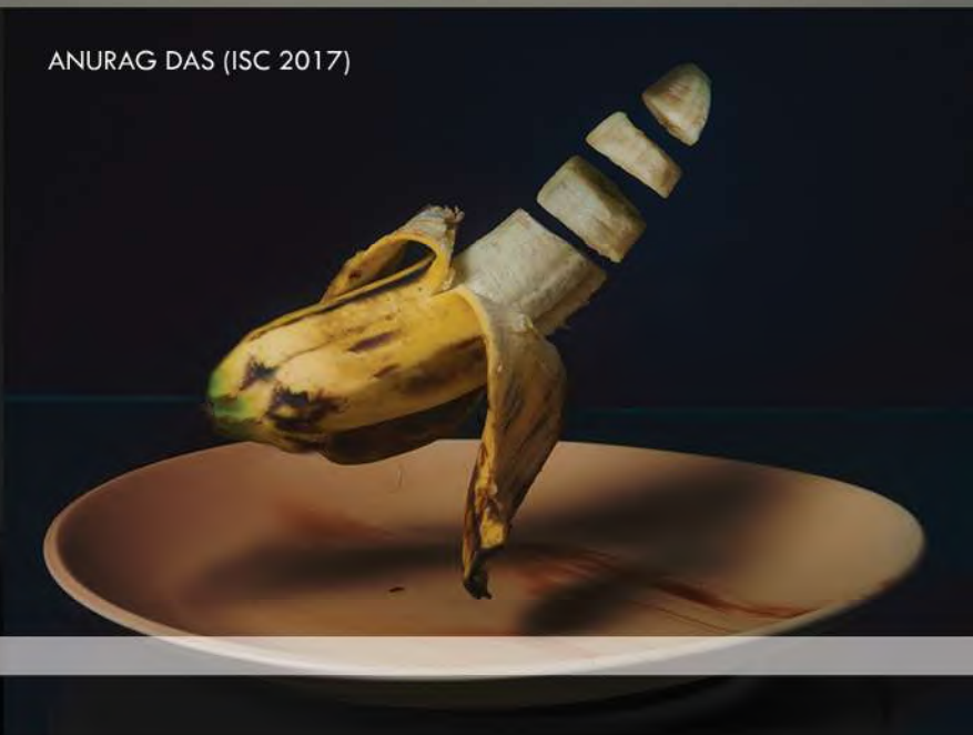
ANURAG DAS (ISC 2017)