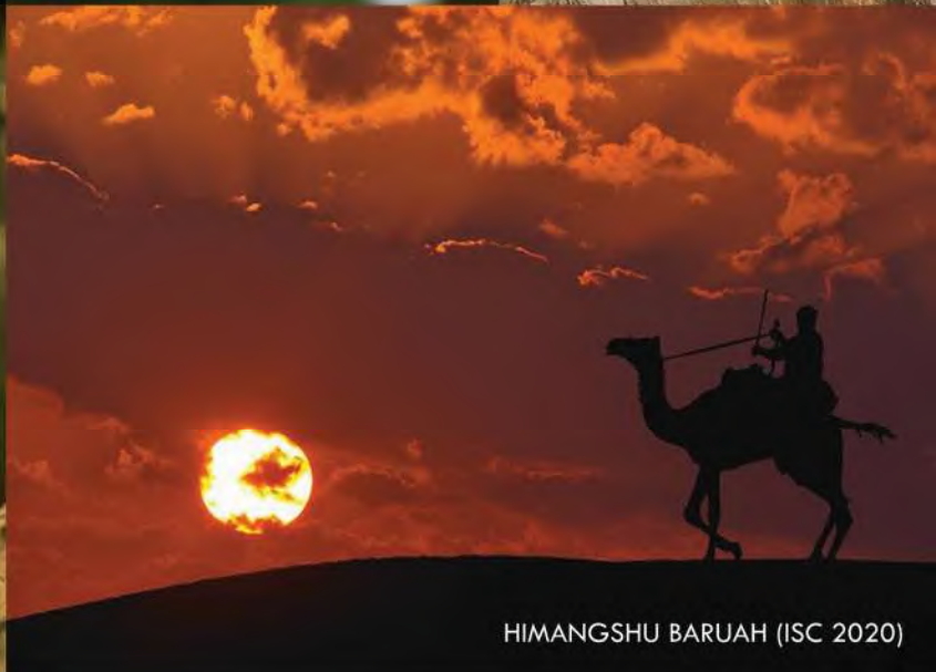
HIMANGSHU BARUAH (ISC 2020)