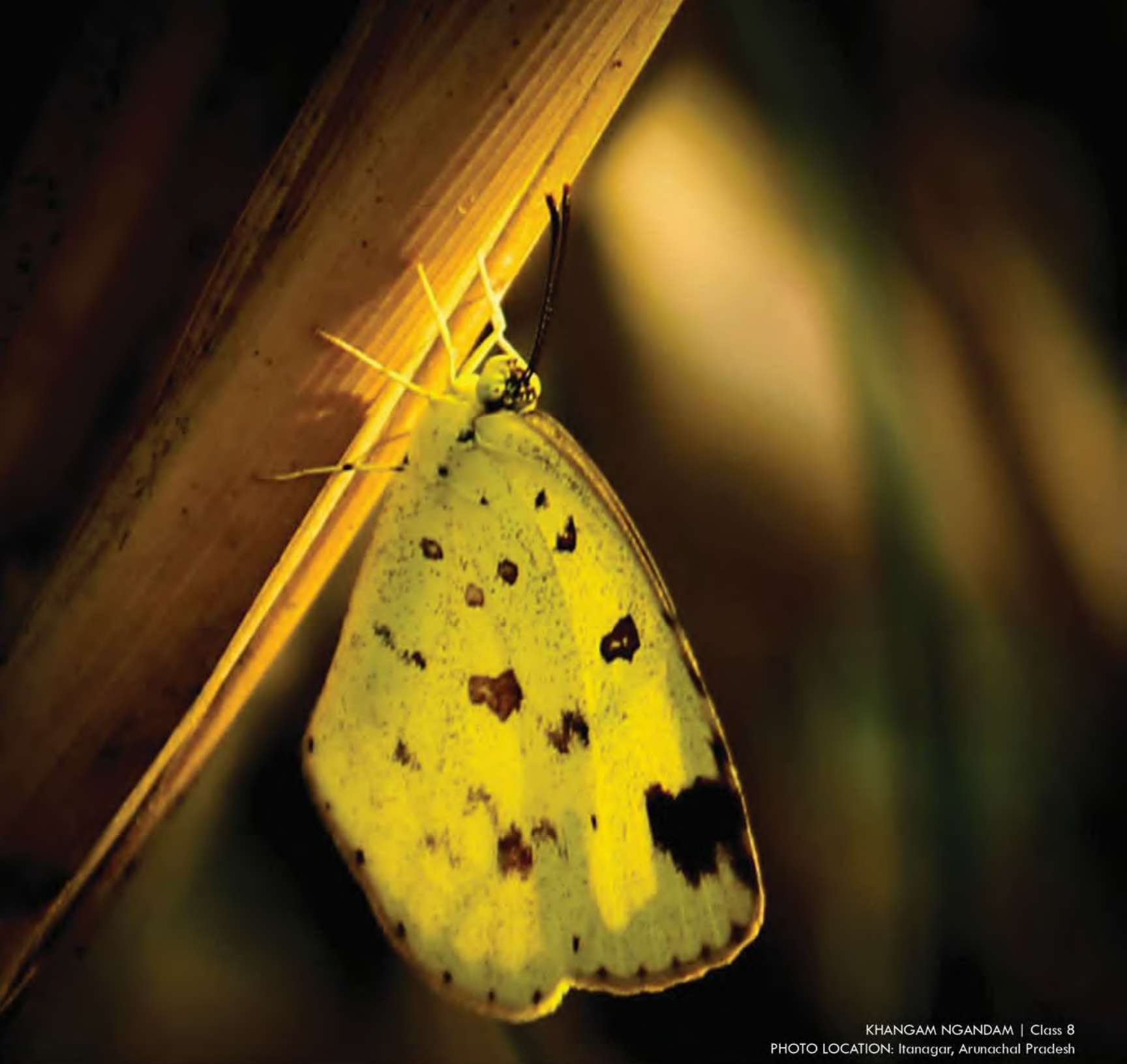
KHANGAM NGANDAM | Class 8 PHOTO LOCATION: Itanagar, Arunachal Pradesh