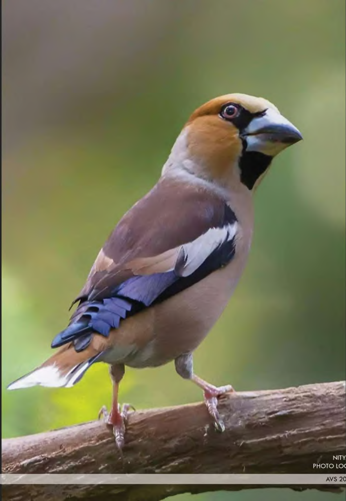
NITYA SARAF | Class 12 PHOTO LOCATION: Jammu, J&K