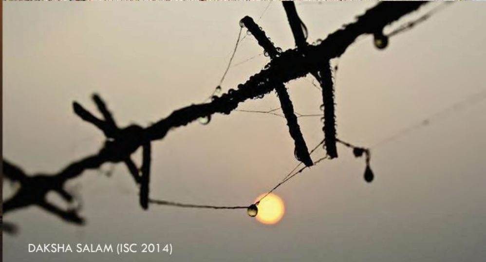
DAKSHA SALAM (ISC 2014)