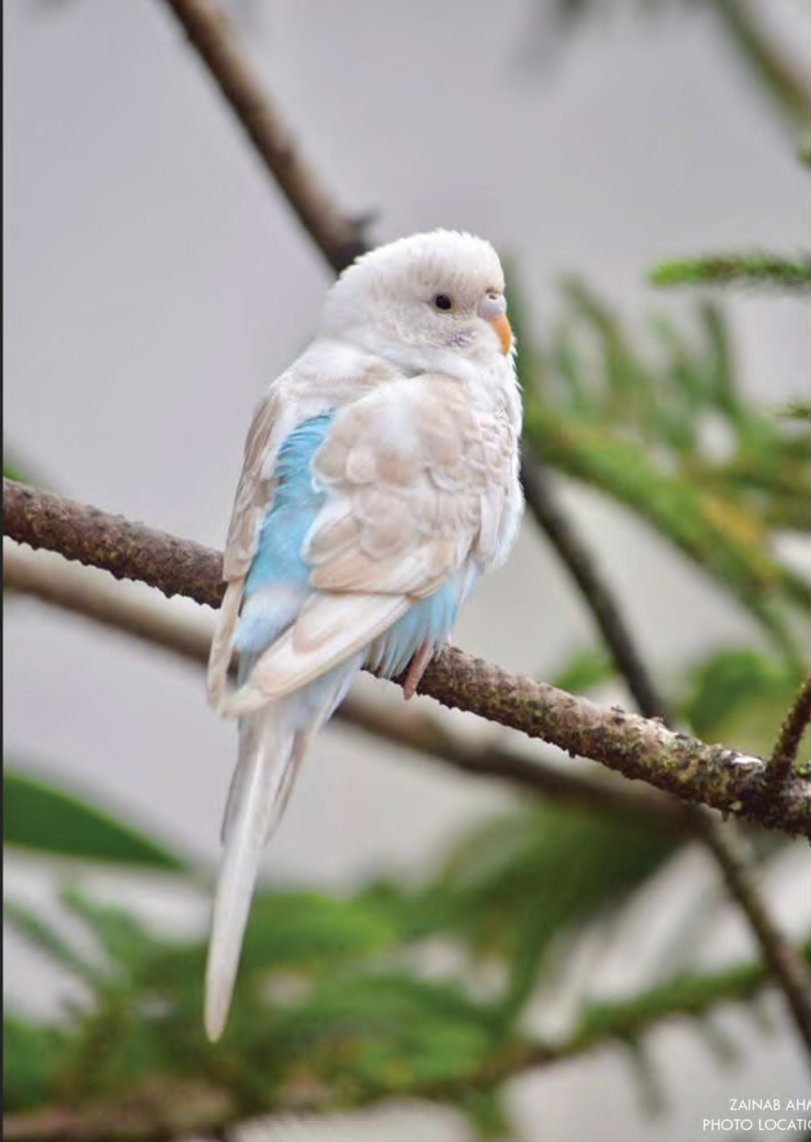
ZAINAB AHMED KHAN | Class 11 PHOTO LOCATION: Dibrugarh, Assam