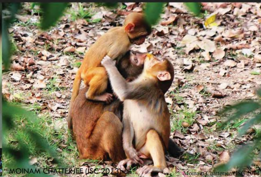
MOINAM CHATTERJEE (ISC 2013)