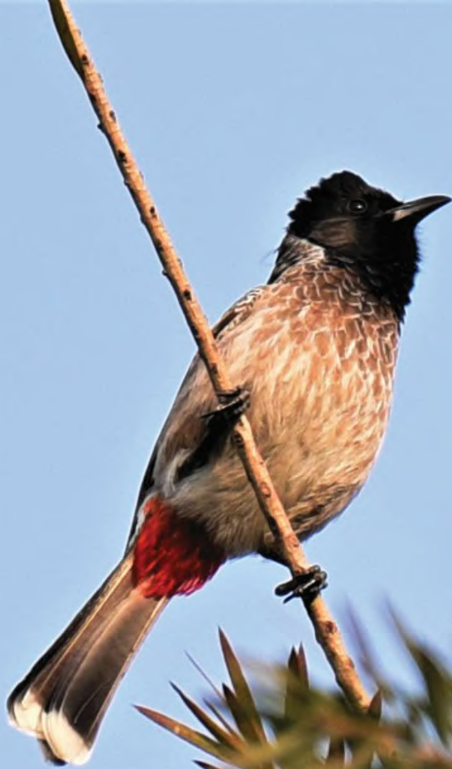
ANIKAITH ANANT JOSHI | Class 8 PHOTO LOCATION: Jaipur, Rajasthan