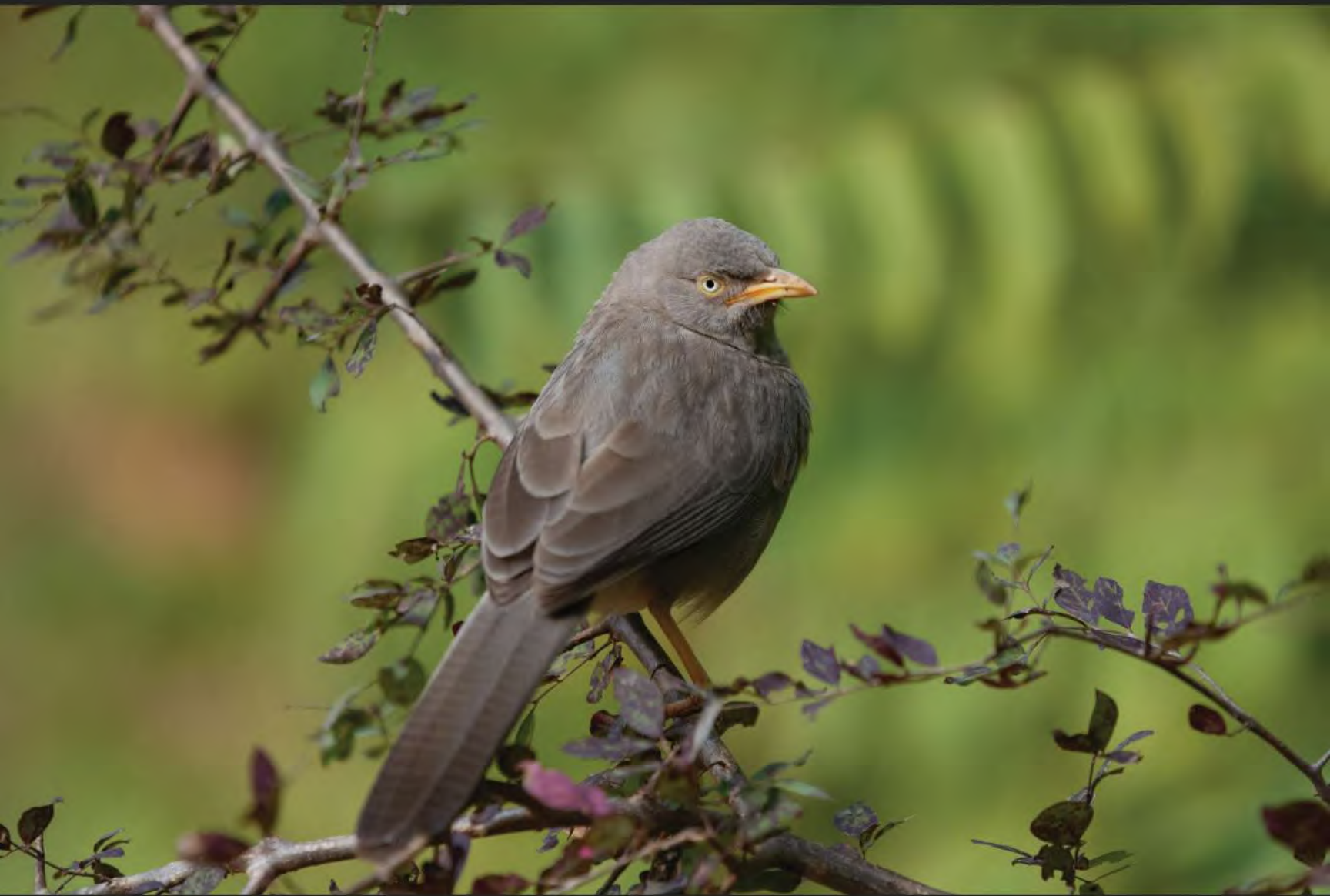
YASHRAJ AGARWAL | Class 10 PHOTO LOCATION: Ranthambore, Rajasthan