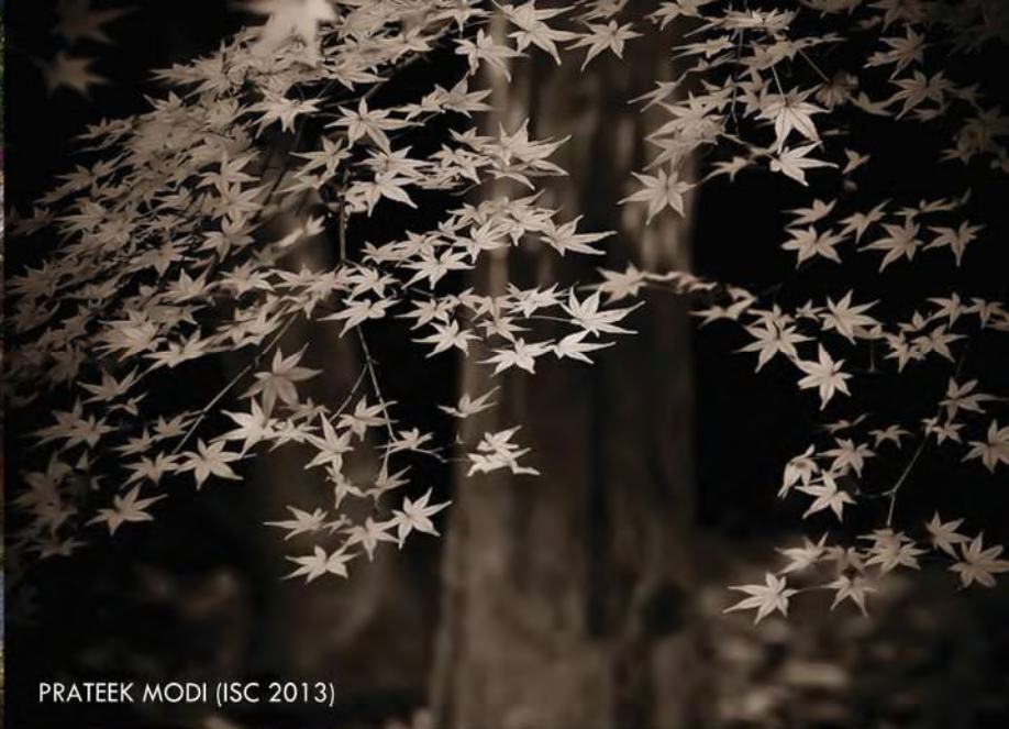
PRATEEK MODI (ISC 2013)