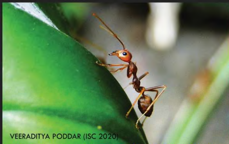
VEERADITYA PODDAR (ISC 2020)