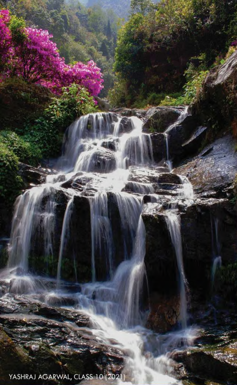
YASHRAJ AGARWAL, CLASS 10 (2021)