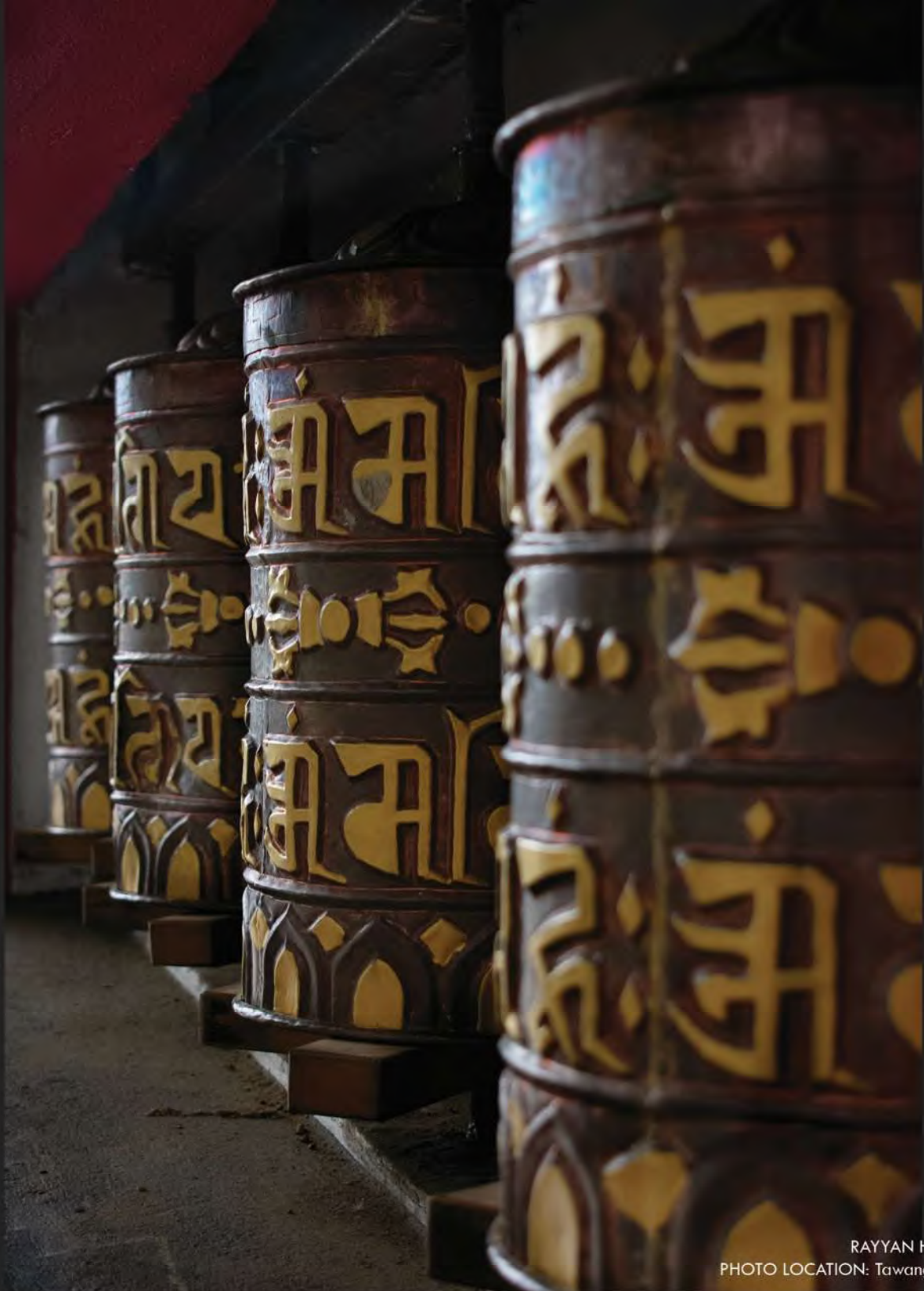
RAYYAN HAZARIKA | Class 10 PHOTO LOCATION: Tawang, Arunachal Pradesh