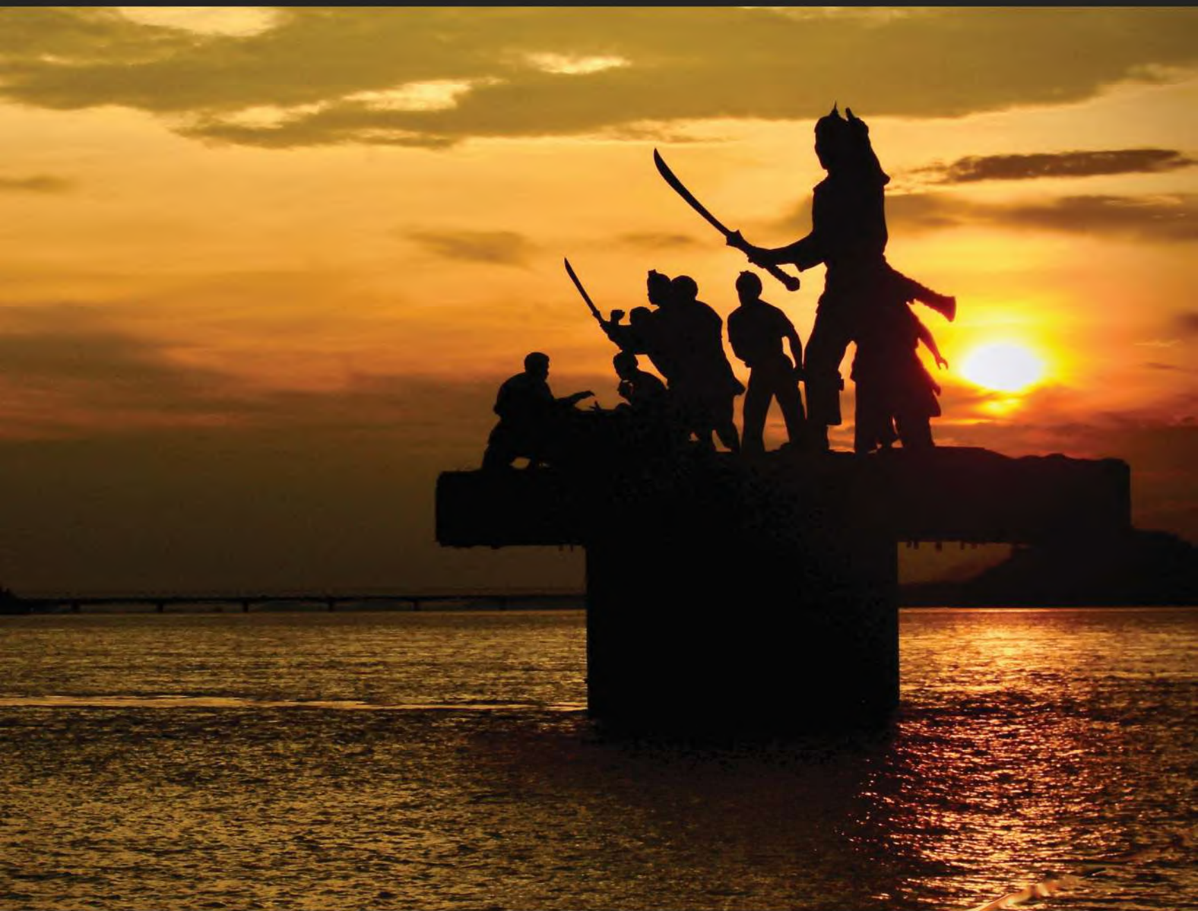
DHRUPAD CHOUDHURY | Class 12 PHOTO LOCATION: Guwahati, Assam Published in the Assam Tribune in the month of November 2020