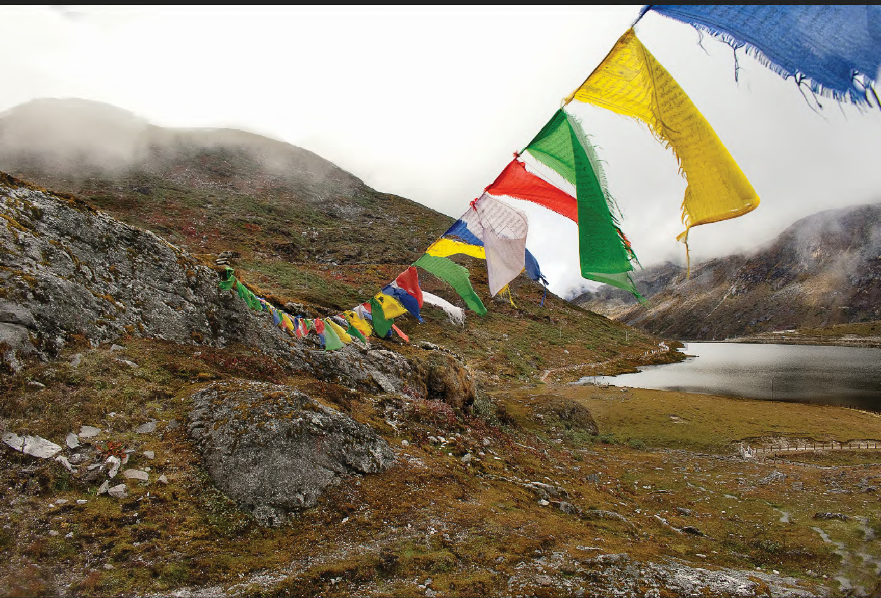
RAYYAN HAZARIKA | Class 10 PHOTO LOCATION: Sela Pass, Arunachal Pradesh