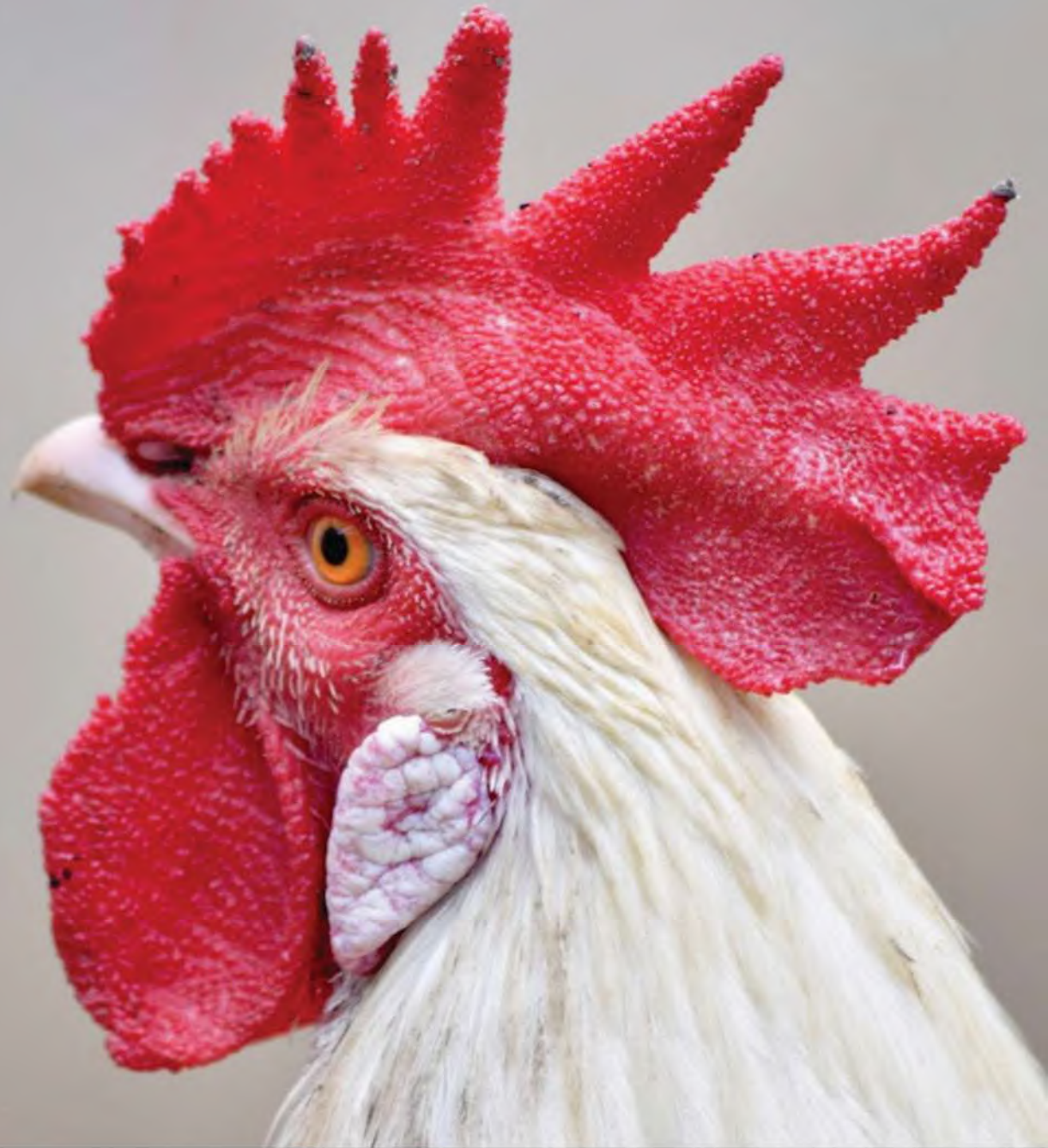
ZAINAB AHMED KHAN | Class 11 PHOTO LOCATION: Dibrugarh, Assam