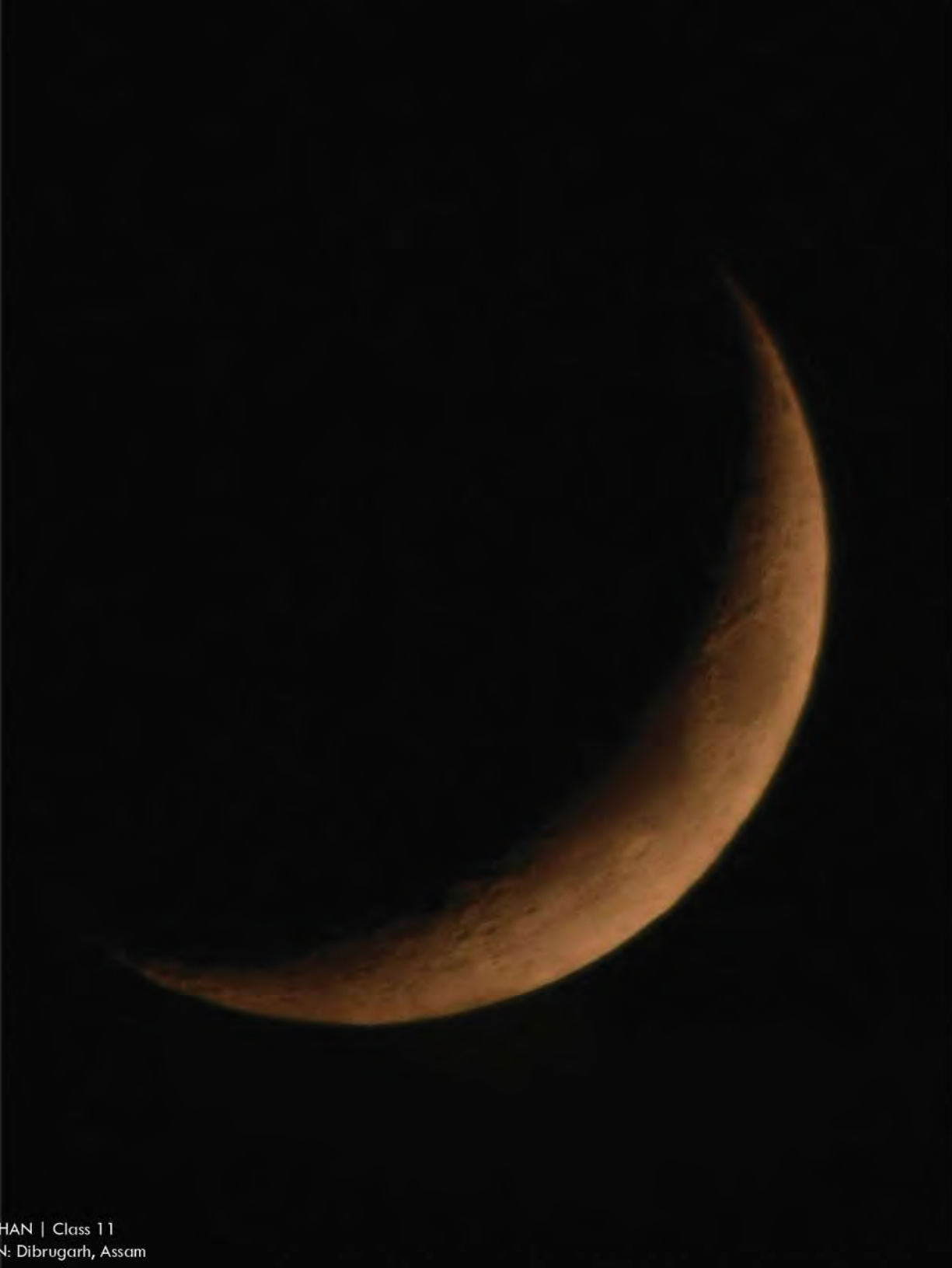
ZAINAB AHMED KHAN | Class 11 PHOTO LOCATION: Dibrugarh, Assam