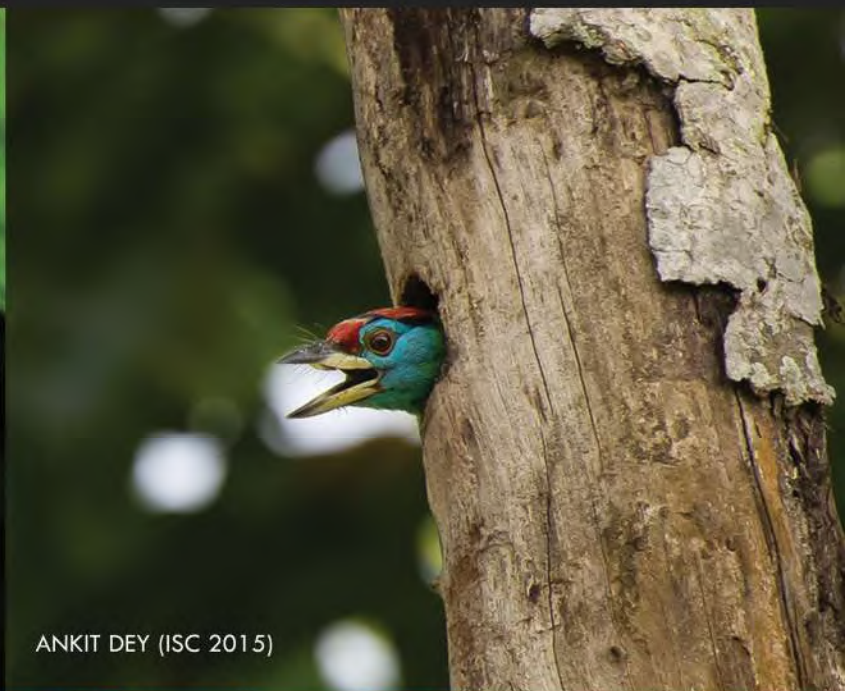
ANKIT DEY (ISC 2015)