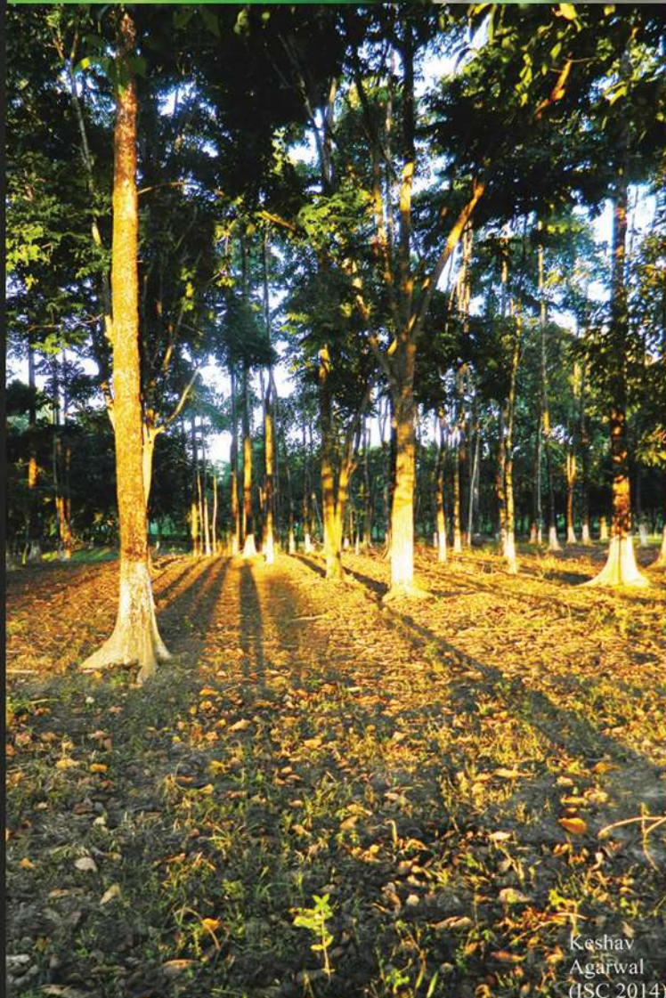
Keshav Agarwal (ISC 2014)