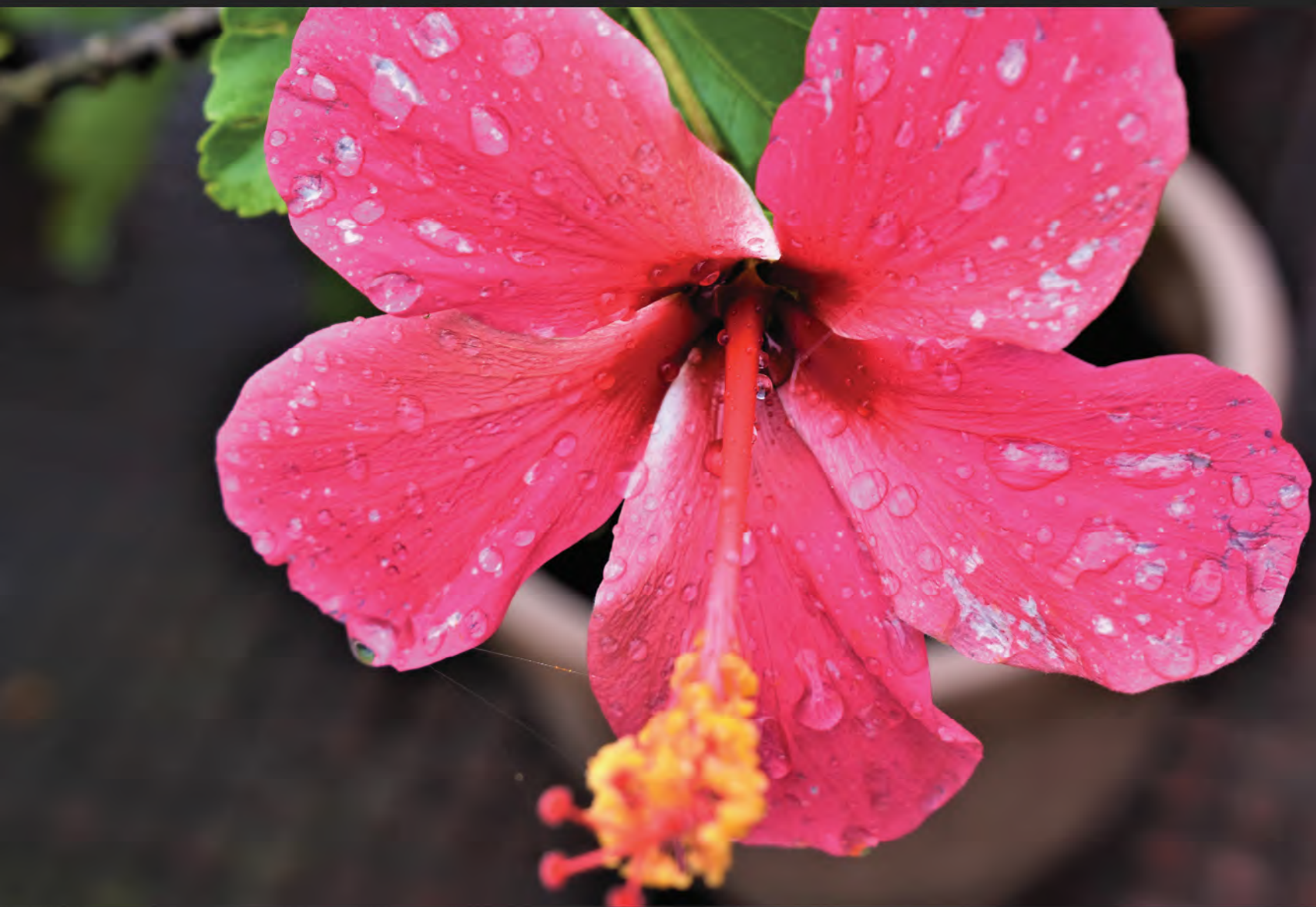
AWANYA JASRASARIA, Class 9 PHOTO LOCATION: Dibrugarh, Assam