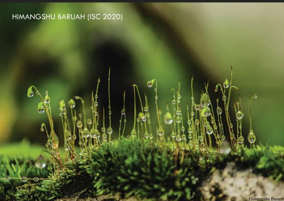
HIMANGSHU BARUAH (ISC 2020)