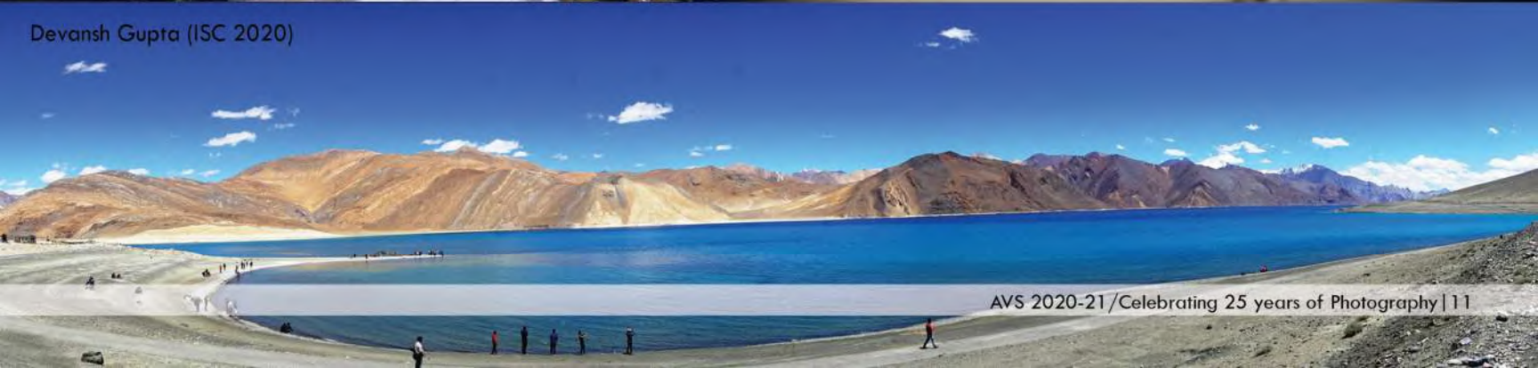
Devansh Gupta (ISC 2020)