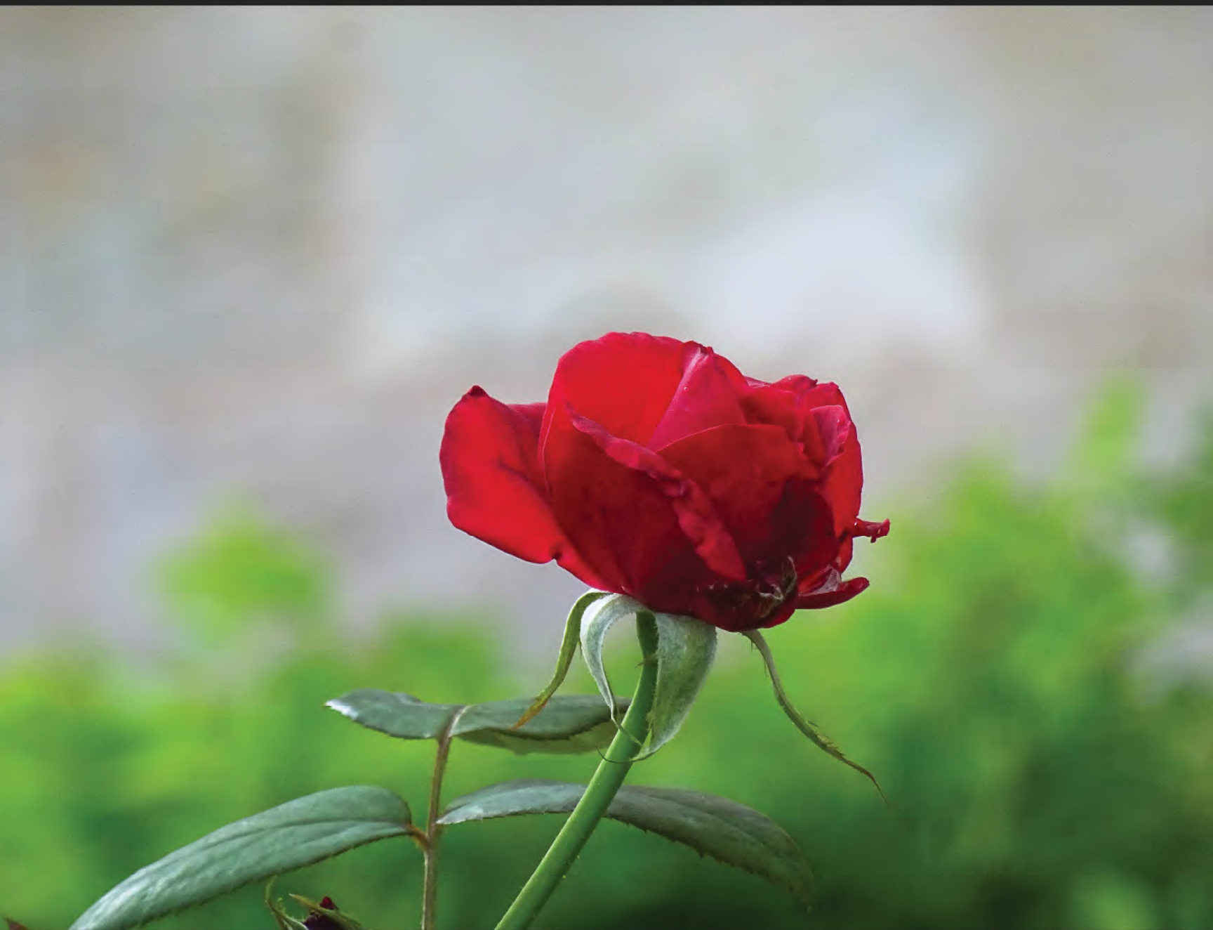
HARDIK PODDAR | CLASS 6 PHOTO LOCATION: Goalpara, Assam