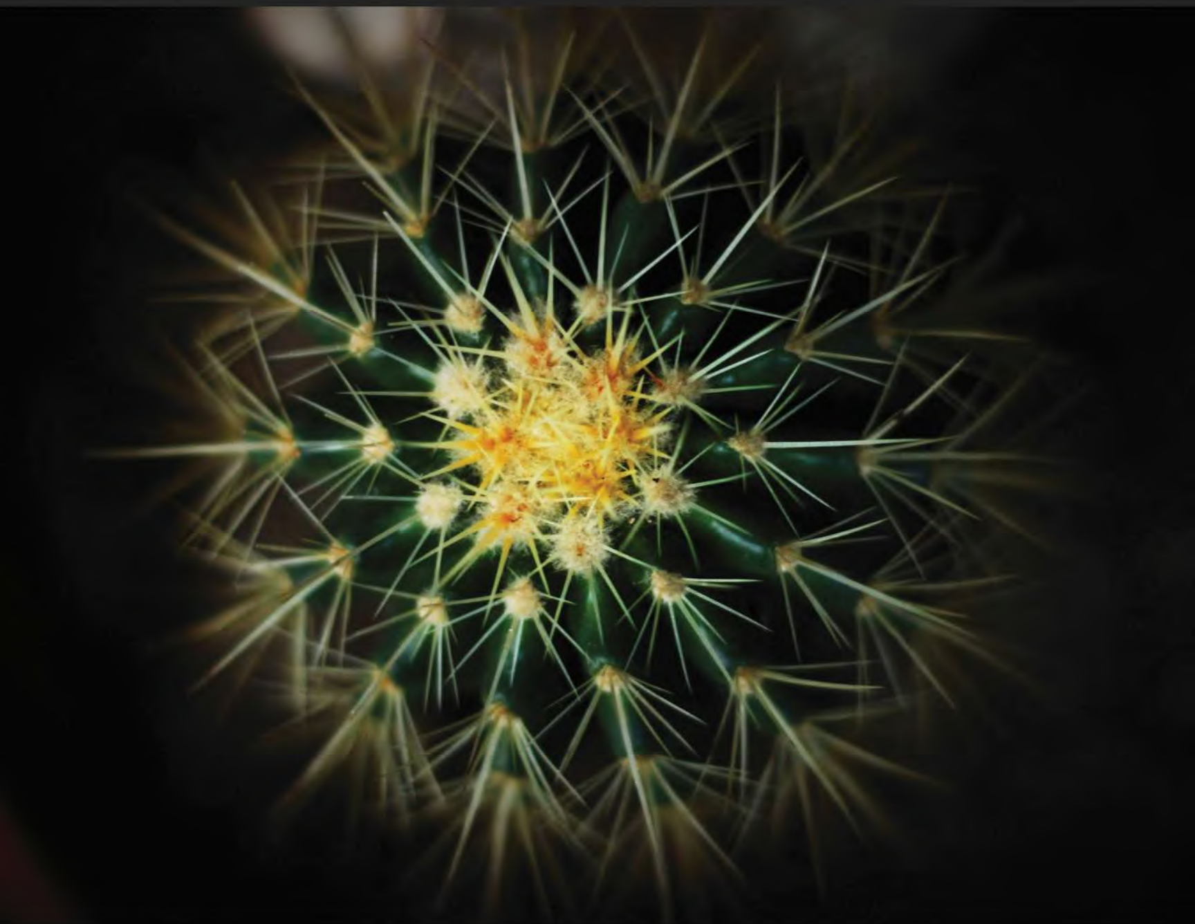
ARNAV DUTTA | Class 8 PHOTO LOCATION: Balipara, Assam