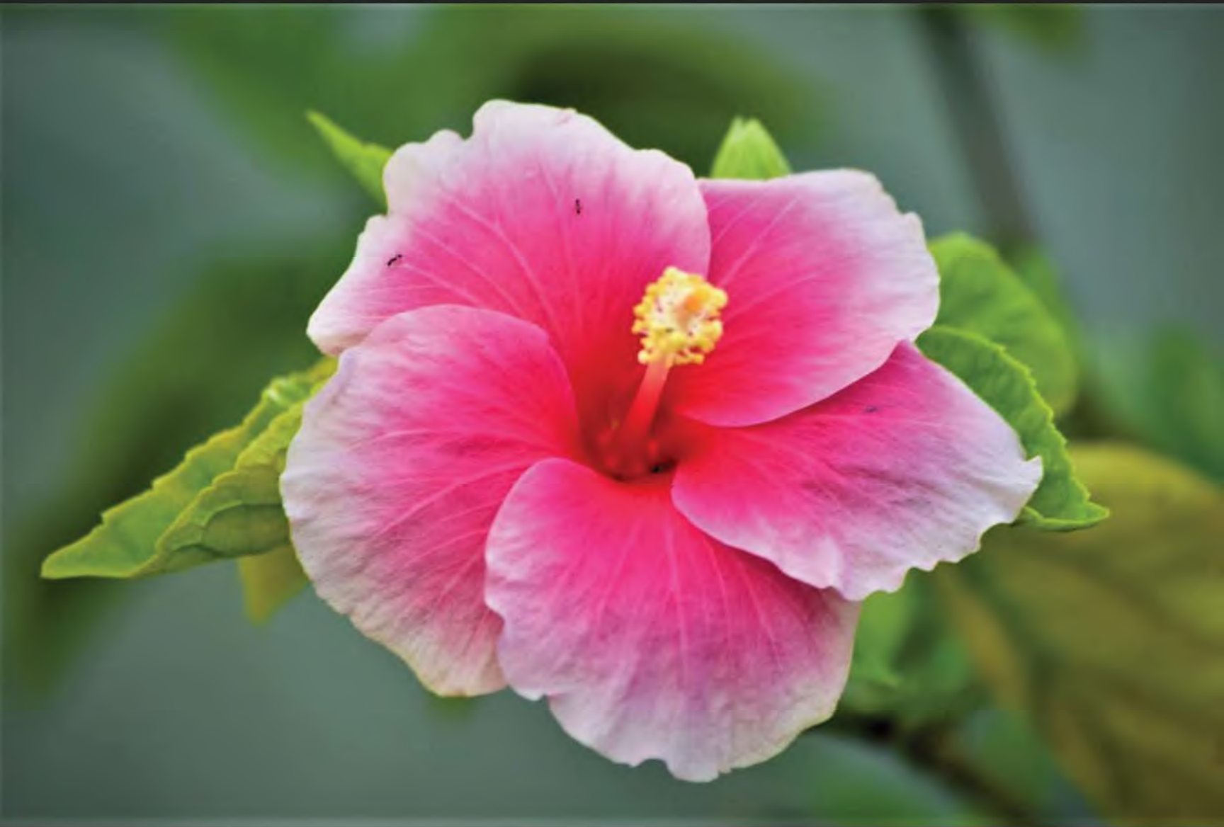
ZAINAB AHMED KHAN | Class 11 PHOTO LOCATION: Dibrugarh, Assam