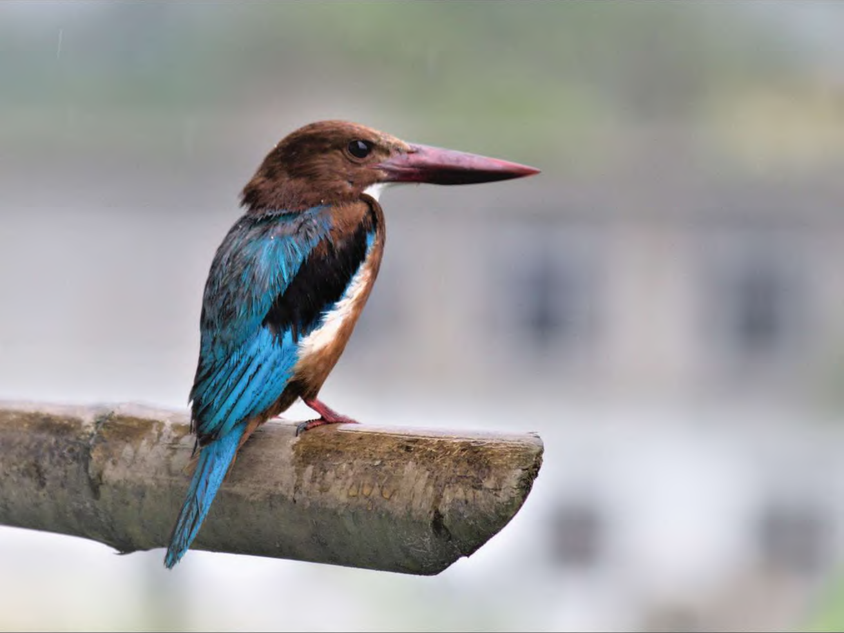
SHREY MODI | Class 10 PHOTO LOCATION: Nagaon, Assam Published in the Assam Tribune in the month of November 2020