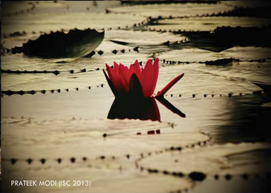
PRATEEK MODI (ISC 2013)