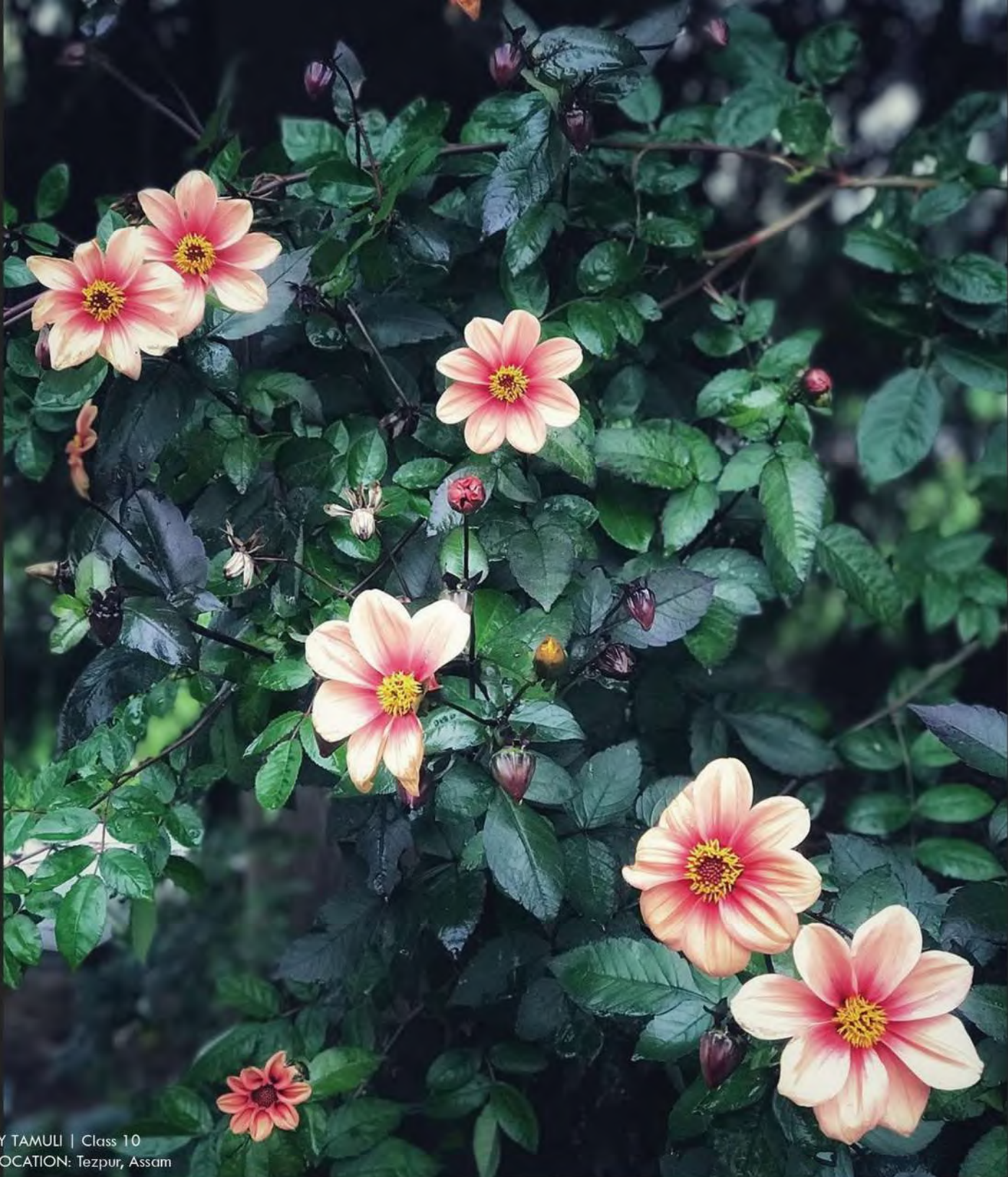
CHINMOY TAMULI | Class 10 PHOTO LOCATION: Tezpur, Assam