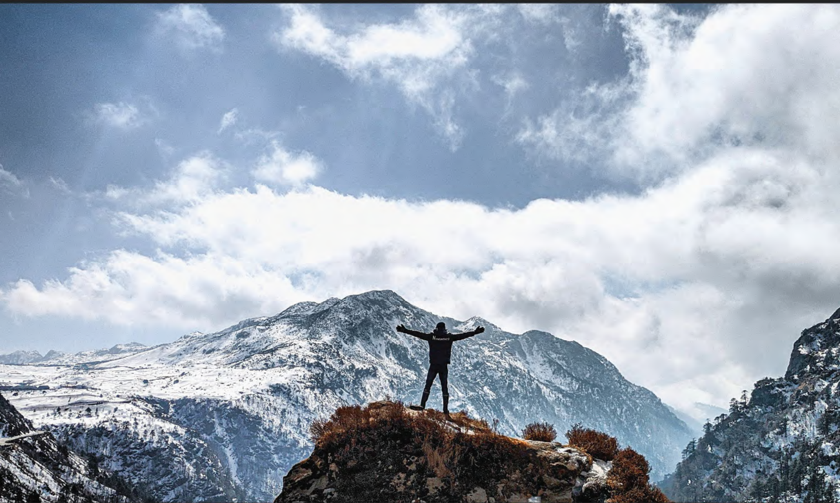
ARYAN BURAGOHAIN | Class 11 PHOTO LOCATION: Uttarakhand