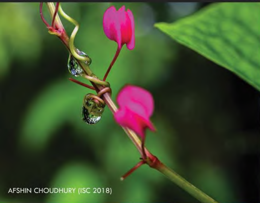
AFSHIN CHOUDHURY (ISC 2018)