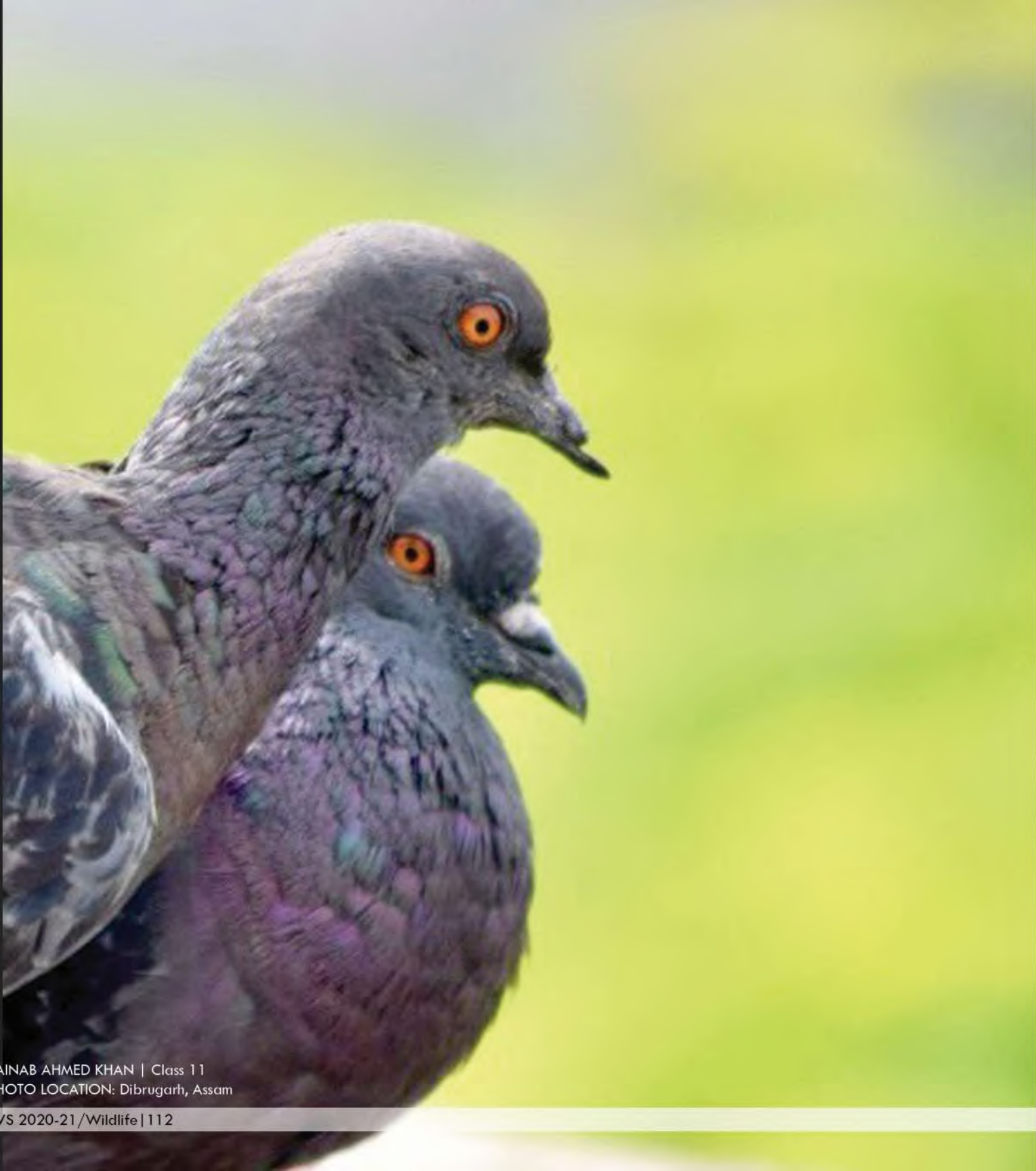
ZAINAB AHMED KHAN | Class 11 PHOTO LOCATION: Dibrugarh, Assam