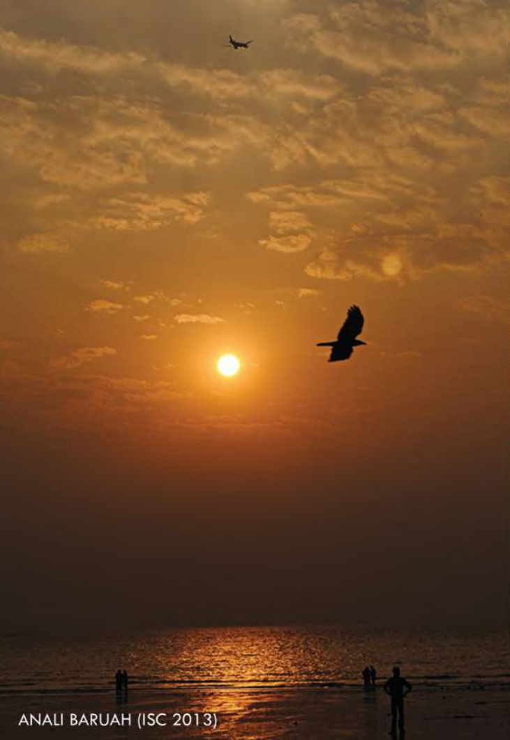
ANALI BARUAH (ISC 2013)