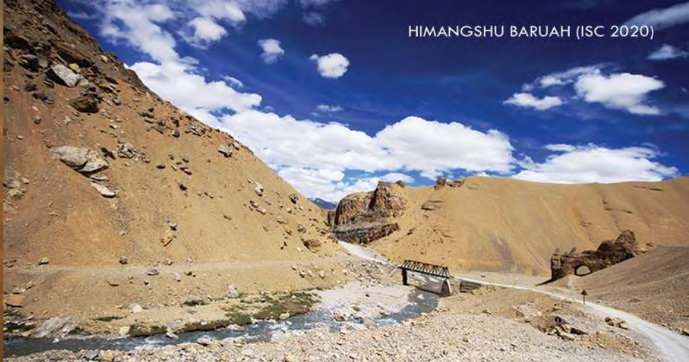
HIMANGSHU BARUAH (ISC 2020)