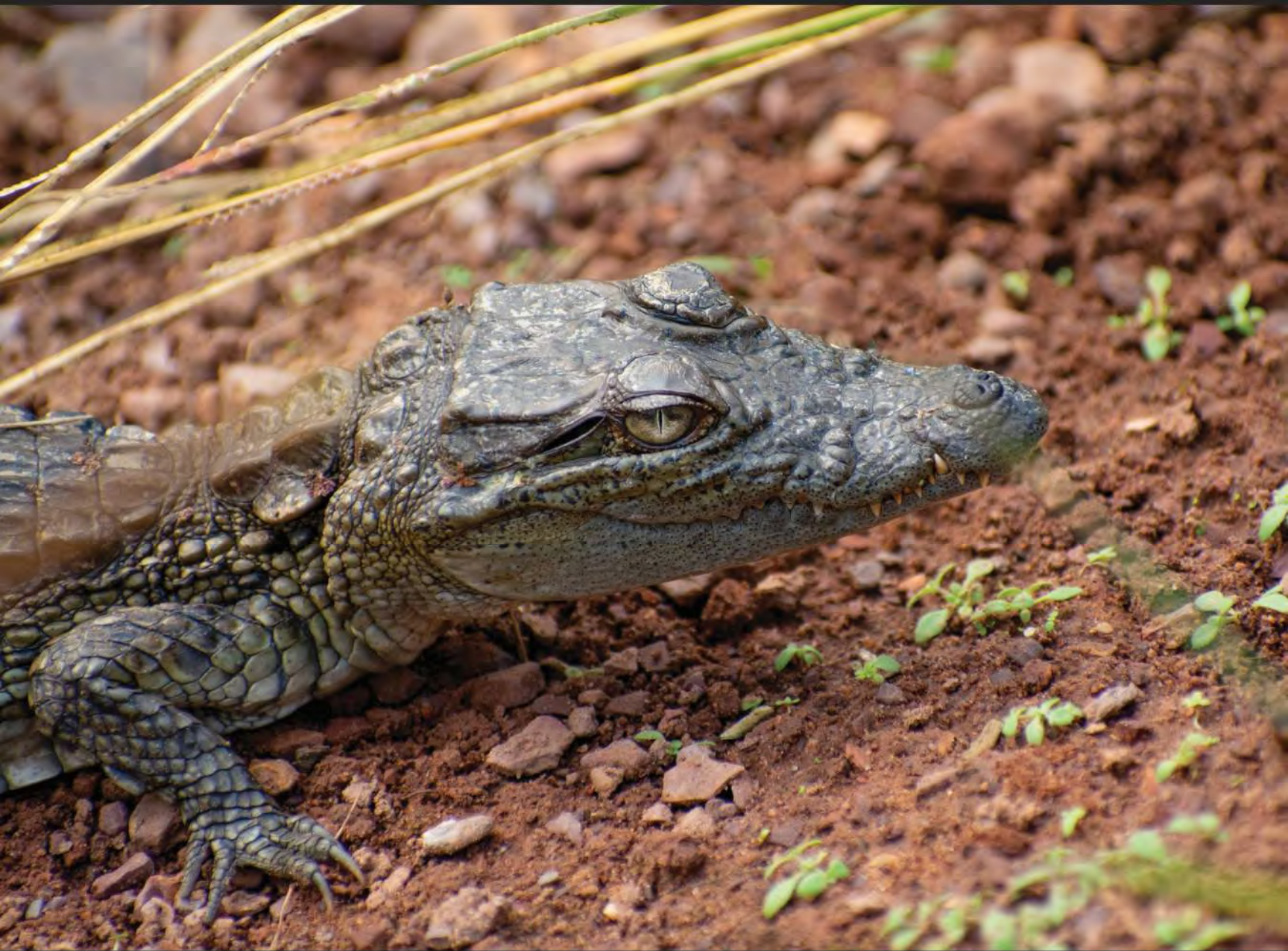
YASHRAJ AGARWAL | Class 10 PHOTO LOCATION: Ranthambore, Rajasthan