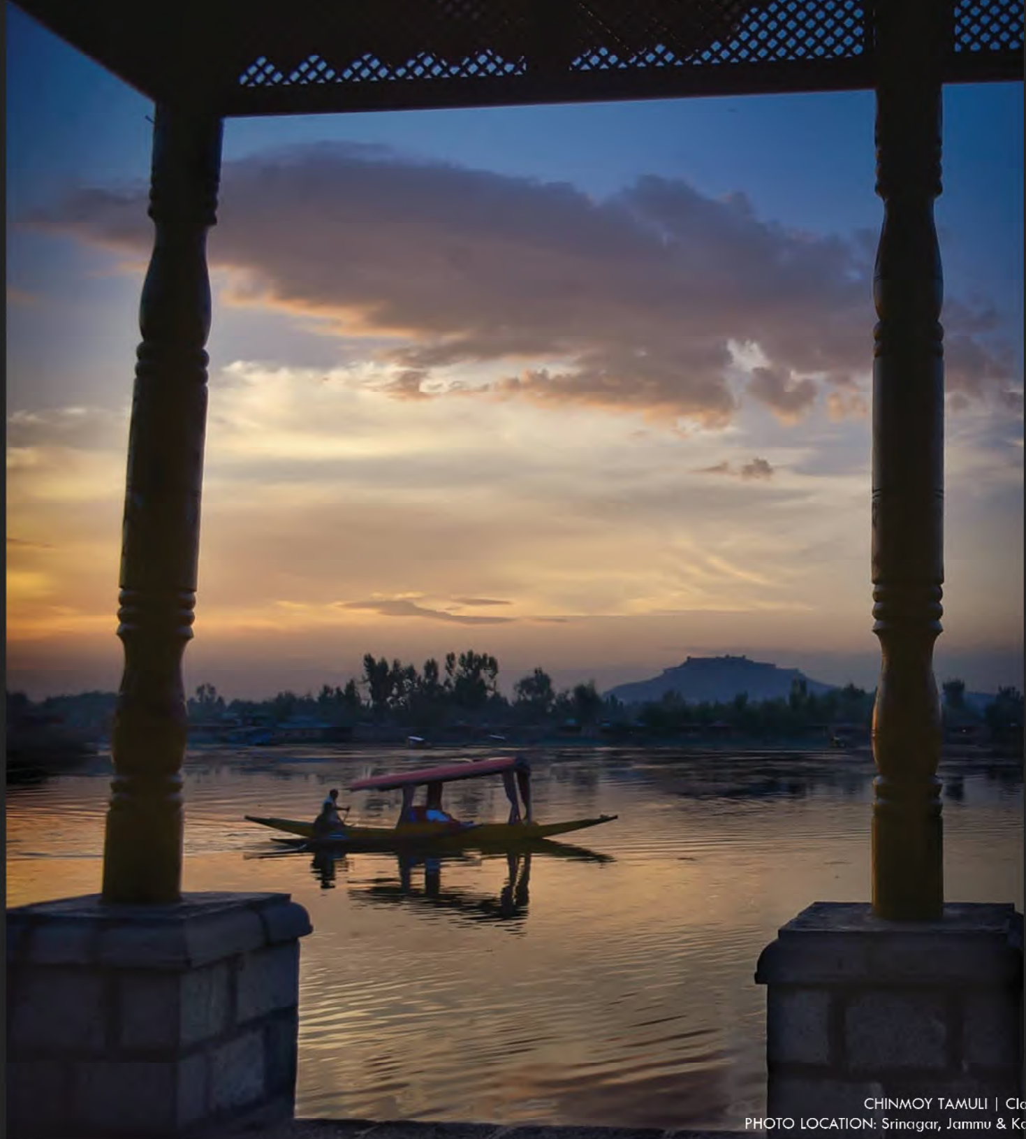
CHINMOY TAMULI | Class 10 PHOTO LOCATION: Srinagar, Jammu & Kashmir