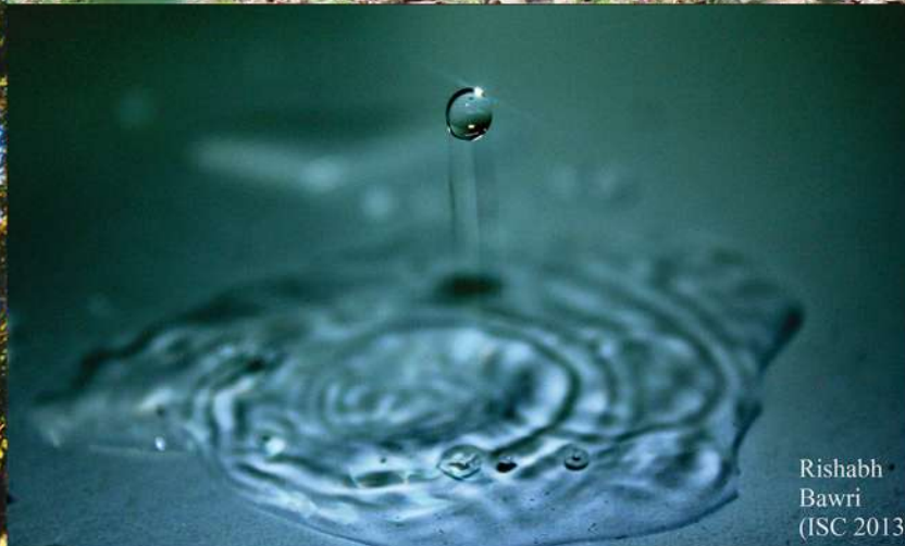
Rishabh Bawri (ISC 2013)