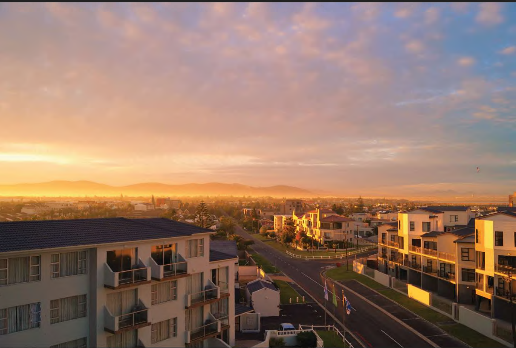
RAAHIL HAZARIKA | Class 11 PHOTO LOCATION: Cape Town, South Africa