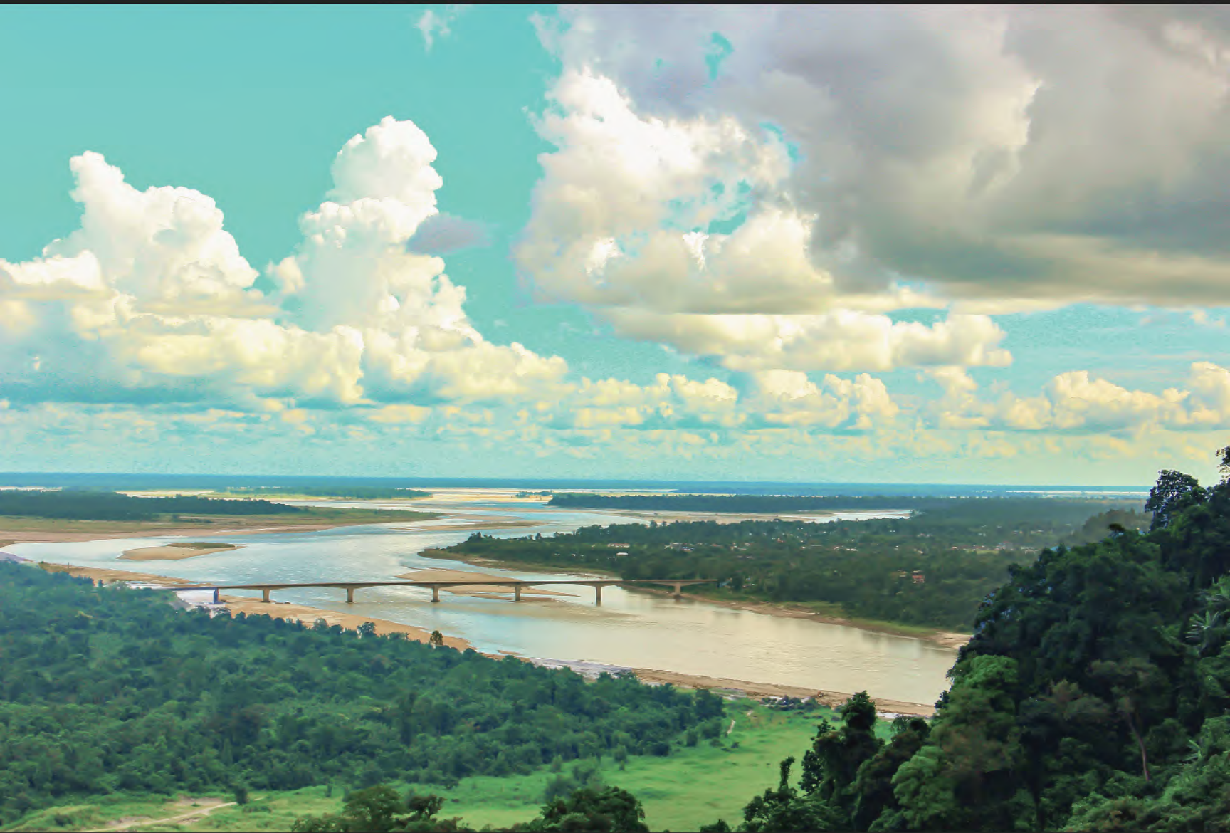
ARNAV DUTTA | Class 8 PHOTO LOCATION: Dibrugarh, Assam