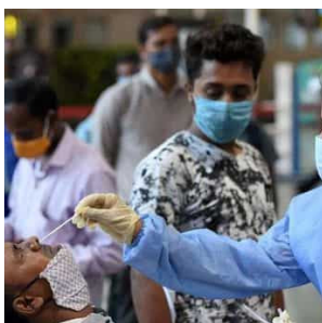
Maharashtra, Covid Testing