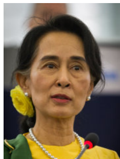
Aung San Suu Kyi