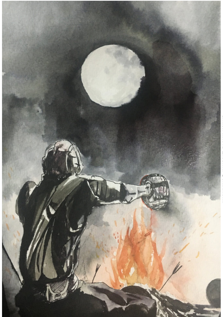
Illustration: Elozini Senachena

He picked it up and put it inside his sleeves. And under the sepulchral glow of the moon that seemed paler than usual, he muttered to himself, “It is a fine night tonight.” He then turned towards the village in the mountains. “I wonder if they would give me some more nectar.”