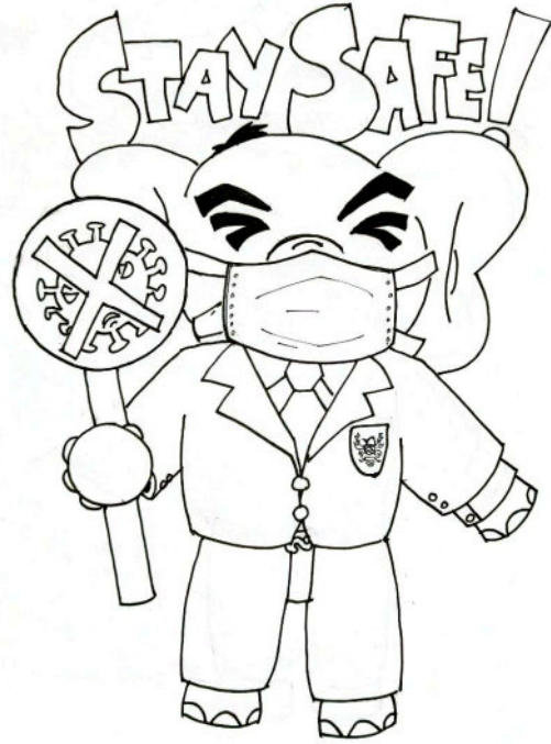
Illustration: Karun Thapa