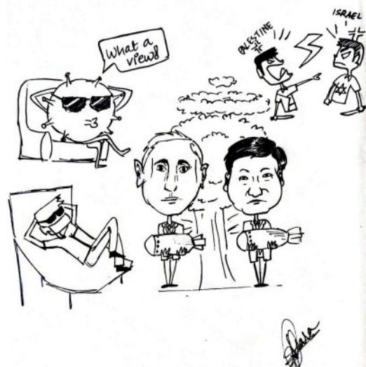
Illustration: Sara Jha

Russia and China set to start their biggest N-power project on May 19. Hamas-Israel fighting continues relentlessly even as calls for peace mounts and countries take sides. Amid the tidal wave of the pandemic, the country sees a ray of hope in DRDO's new Covid19 2DG drug cleared for use. States see citizens step up to the cause and pool in resources to fend for themselves. Top virologists of the world shaken with the possibility that the Wuhan Virus was indeed lab made as they seek fresh probe. Post-election violence in Bengal continues even as the Courts take their vacation.