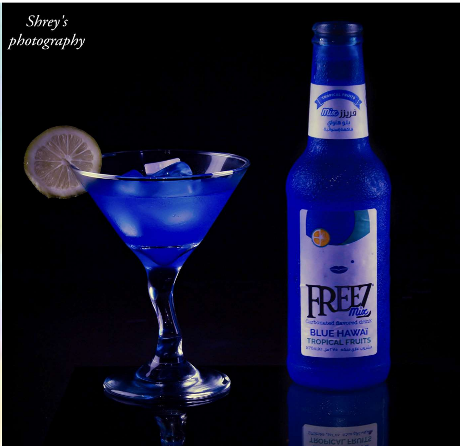
Shrey Modi, Class 11 Place: Dibrugarh Assam Canon 1200D (f/6.3, 1/80 Sec. & ISO 200)