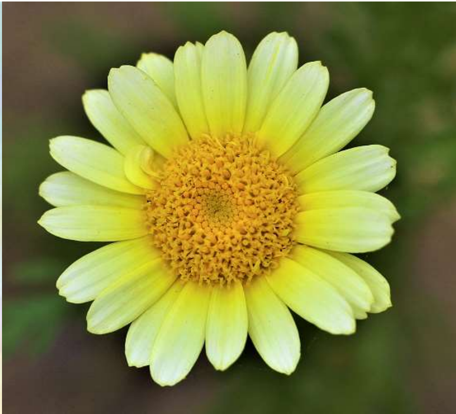
Arnav Dutta, Class 9 Place: Balipara, Assam Canon EOS 600 D (f/3.5, 1/1600 Sec. & ISO 100)