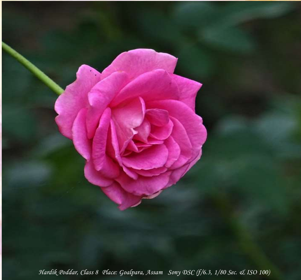
Hardik Poddar, Class 8 Place: Goalpara, Assam Sony DSC (f/6.3, 1/80 Sec. & ISO 100)