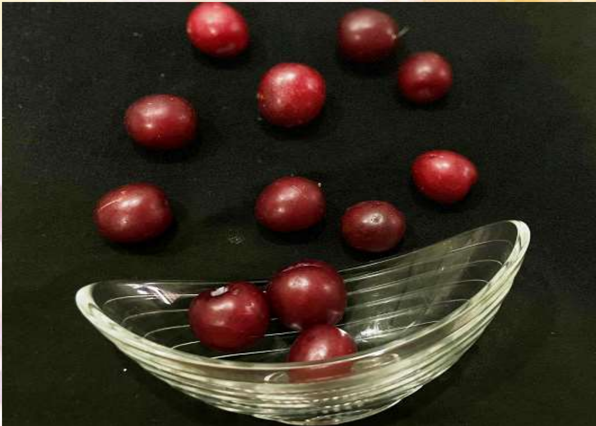
Mahita Jindal, Class 11 Place: Tinsukia, Assam (Mobile Photography)