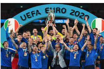
Italy National Football team