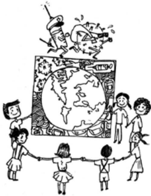
Illustration: Ssara Jha, X

The AVS Round Square Committee successfully organised yet another virtual conference of schools from around the globe. Twenty nine schools from five countries including United Kingdom, Oman, Pakistan, Bangladesh, and India joined the conversation revolving around diversity, inclusion, stereotypes, uniqueness and world peace. The theme for this year was “Diversity is the art of thinking independently together”, advocating the first of the five IDEALS, Internationalism.