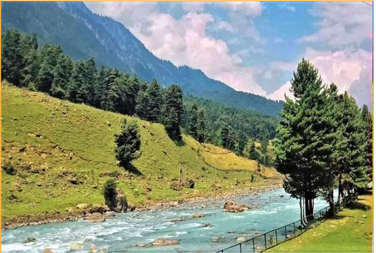
Nazifa Noorine, Class 7 Place: Pahalgam, J&K Canon 1200D (f/8, 1/250 Sec. & ISO 200)