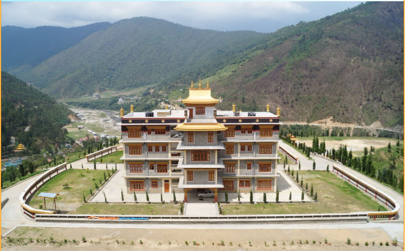
Raahil Hazarika, Class 12 Place: Dirang, Arunachal Pradesh (Sony A58 f/10, 1/200 Sec. & ISO 100)