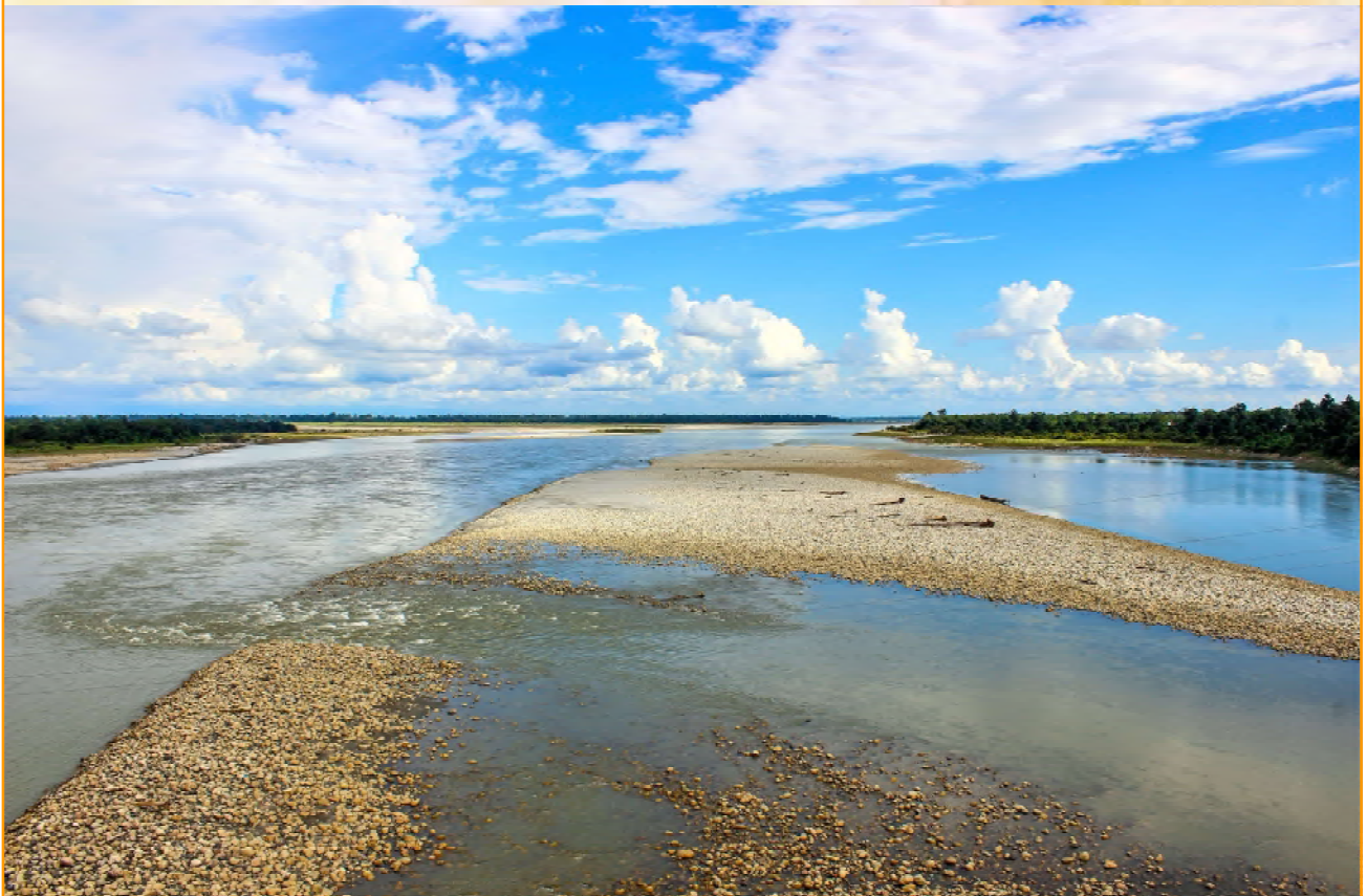
Arnav Datta, Class 9 Place: Dibrugarh, Assam Canon 1200D (f/6.3, 1/80 Sec. & ISO 200)