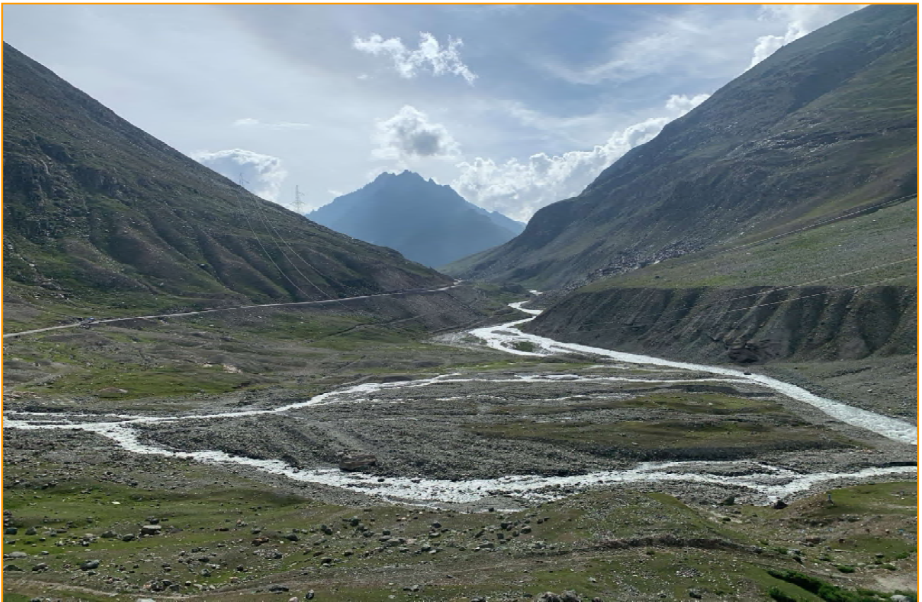
Mahita Jindal, Class 11 Place: Leh & Ladakh, J&K (Mobile Photography)