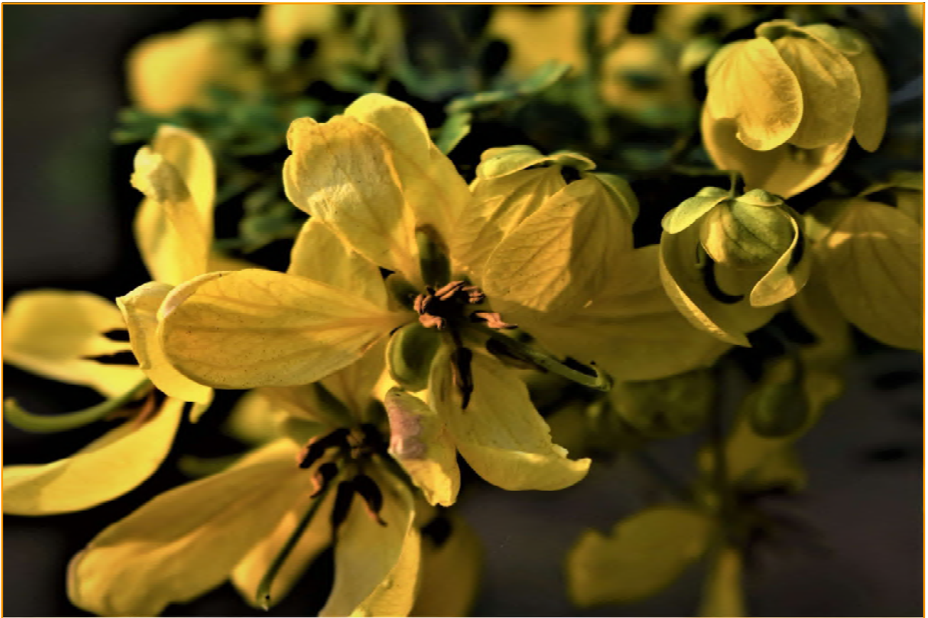
Awanya Jasrasaria, Class 9 Place: Dibrugarh, Assam Nikon D3500 (f/6.8, 1/250 Sec. & ISO 125)