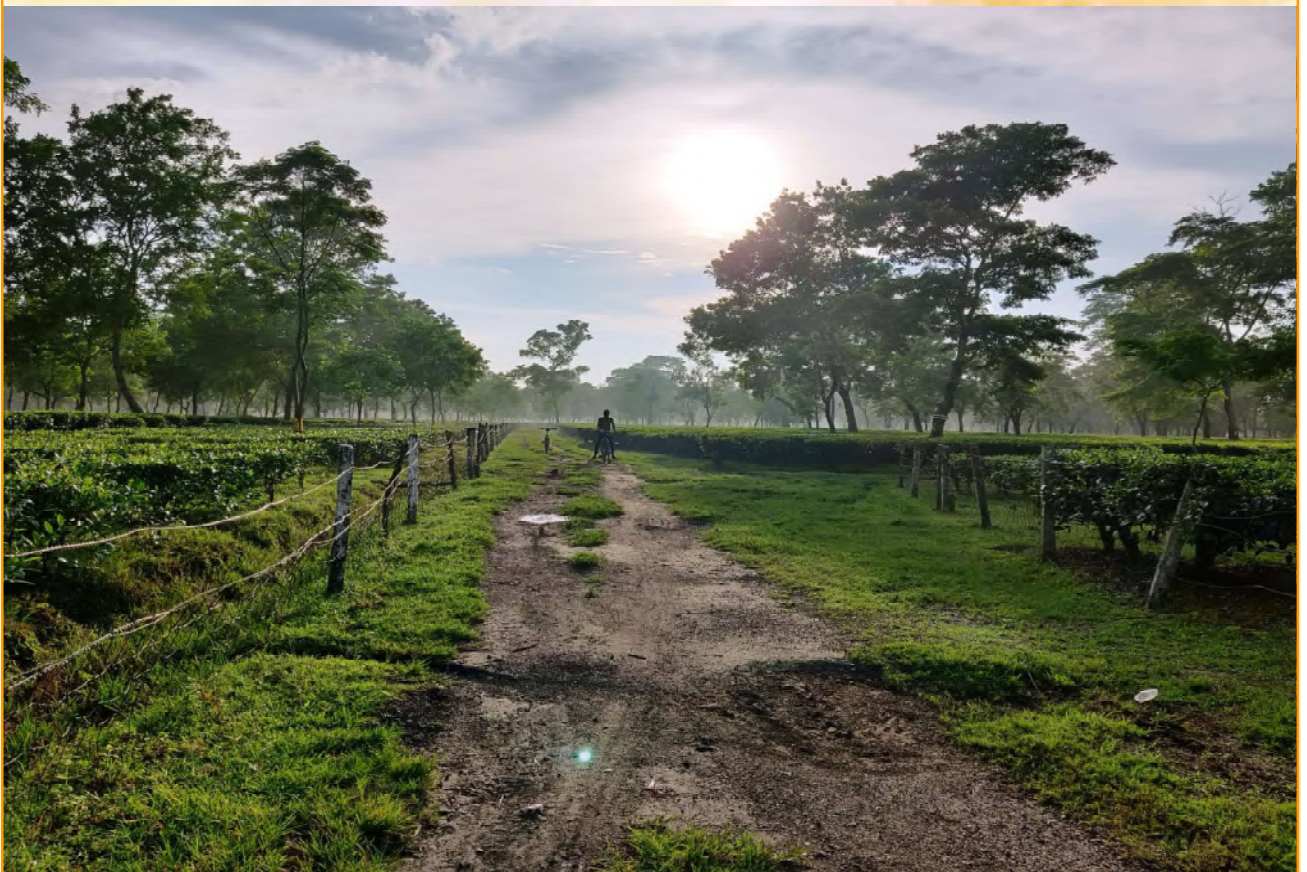
Reyaan Alam, Class 10 Place: Jakhbandha, Assam Oneplus A6010 (f/1.7, 1/510 Sec. & ISO 100)