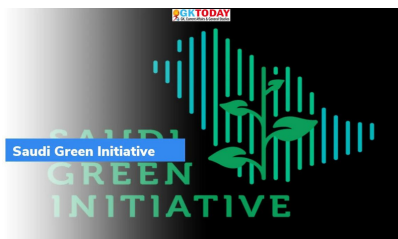
Saudi Green Initiative