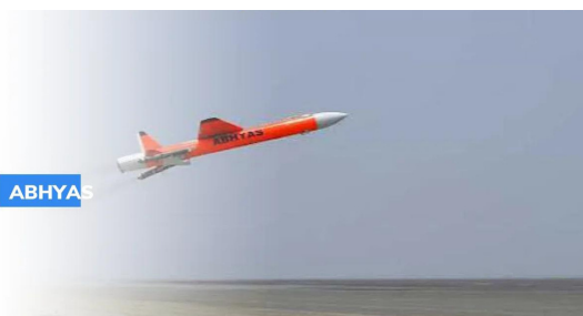
launch of ABHYAS