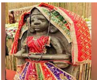
Idol of Goddess Annapurna