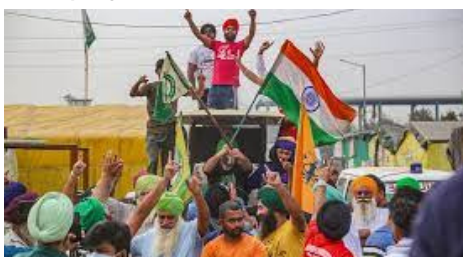
Farmers celebrating after PM repeals farm laws.