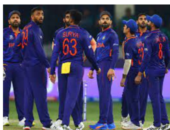
India maintain a winning streak against NZ (3-0)