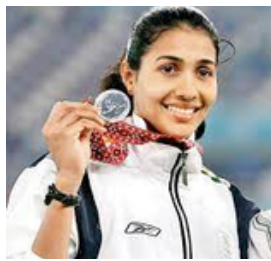
Anju Bobby George