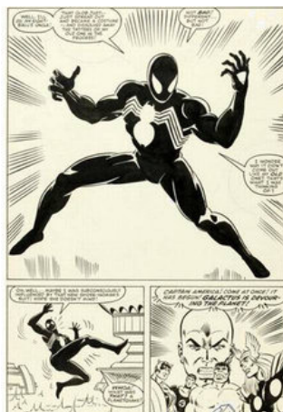
Spider-man comic book page sold for record 3.36 million