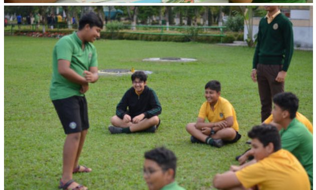
Intra School Conference