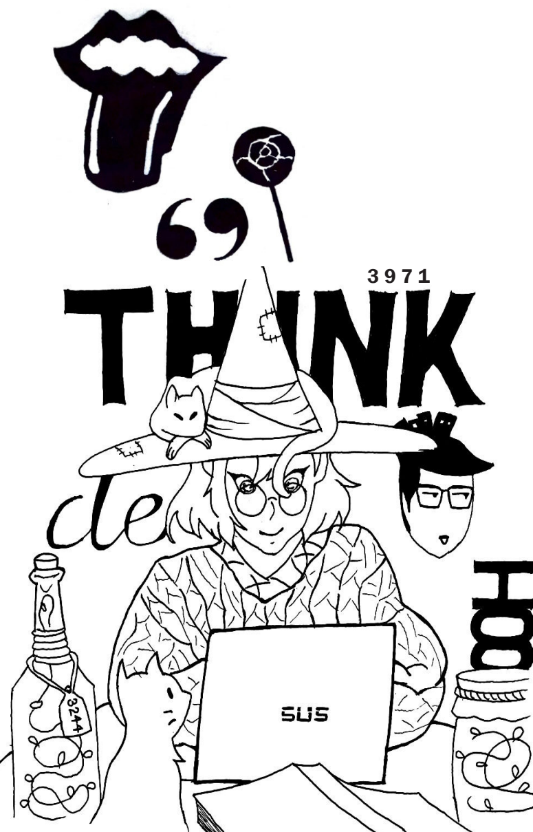
Illustration by: Neelabh Kashyap, Associate Editor (Batch of 2022)

Once upon a first of September, Two editors and I were in the Room. “When’s your birthday?”, they asked. “The first of September.” “Your zodiac?” Their question loomed— “Wait, today is the first of September...” How we must have humoured the walls that day. The walls- they watch and listen. Sheltering secrets and sharing only silence. The windows? That’s for when I bend around post sixty-nine, To peek and see whether the drapes are moving or still. And know if dreamers rest in Lucy’s roost. When the week’s work concludes, And the board’s face is cleaned— Beads of starlight shine at the bend of a switch, And I think, “Are these the memories of the future?” “When I see them shine in a glass bottle. There comes a season once a year, When paint buries itself and births a painting. When a painting is all that remains, And that painter is but a number on the wall. But Lucy knows, And Lucy stays. Watching, loving and listening for all days.