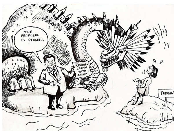
Illustration- Migam Angu, XII

in Tokyo has stated clearly that America will "defend Taiwan", given its stance in Ukraine, Taiwan's future remains a tight walk for the Indo-Pacific countries.