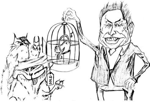
Illustration- Dhrity Khersa, XII

Elon Musk is set to take control of Twitter in a $44 billion deal that could reshape social-media as we know it.