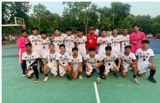
Bronze Cup Winners IPSC, U-17 Football