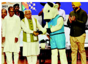
"Dhakad" - Khelo India's new mascot