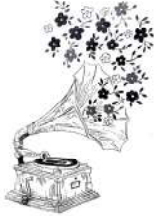
Illustration: Ssara Jha, XI