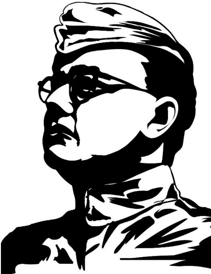
Illustration: Anoti Kinimi, XI