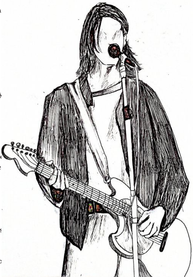
Illustration: Immalemela Imchen, XI

They say an artist’s mind can hold heavens but what if these ‘heavens’ are just a compendium of contradictions? The paradox that plagues them and embeds itself like ancient runes. The paradox of many artists is the Trapped Artist Paradox, where their own work becomes their noose. These paradoxes entrap an artist, spirals them to their downfall and claim its victims such as punk artist, Kurt Cobain from Nirvana and street artist, Banksy. “Cobain seemed to give wearied voice to the despondency of the generation that had come after history, where every move was anticipated, tracked and sold before it even happened.” Quoted Mark Fisher, from Capitalist Realism. Kurt Cobain flourished as a punk artist yet decayed in his own personal life, in his own obsessive art. Cobain’s detested MTV which was an example of this paradox. The more he professed his angst, be it on his own commodification, the more worth was bestowed upon the commodity. This trap slithered its way up till Cobain’s death and churned it like venom. The claws of this paradox raked through Banksy as well. Albeit, his rage was not as haphazard as Cobain’s. Banksy not only targeted the art market with themes as old as 1914, authoritarianism, greed and poverty. This is expressed by art critic Robert Hughes with the sentiment that art has not become a “property to humankind” but rather the “property of those who can afford it.” The art market puts value on art pieces