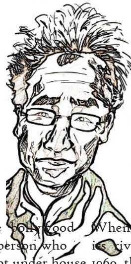
Illustration: Gaurish Saikia, IX