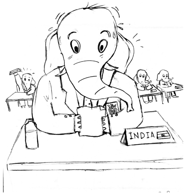
Illustration: Ssara Jha, XII