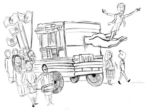
Illustration: Sara Jha, XII

A massive win in Karnataka has given the Congress a shot in the arm and roused the Opposition. They now feel confident to turn the 2024 Lok Sabha elections into a Rahul versus Modi pitch. Troubles brew for Congress in Karnataka as the CM's post sees D.K Shiv Kumar face off with Siddaramaiah. Zelensky is on a whirlwind tour flying from Berlin to Paris to London where he received the red carpet welcome and promises of more fire power. Presidential elections in Türkiye between pro- democracy Kilicdaroglu and Erdogan will play an important role in where Europe heads next.