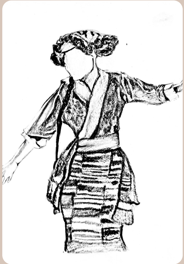
Illustration: Gaurish Satkha, X