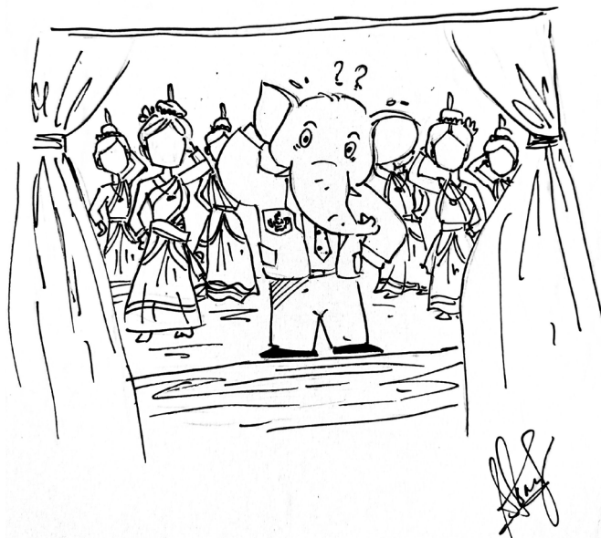
Illustration: Ssara Jha, XII