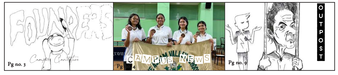
Saturday, October 7th, 2023