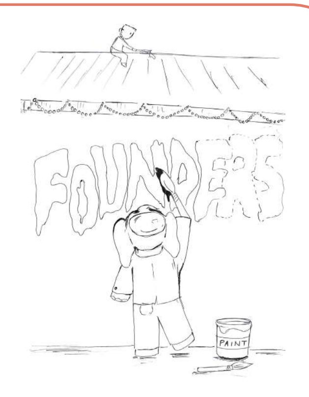
Illustration: Imnalemla Imchen, XII