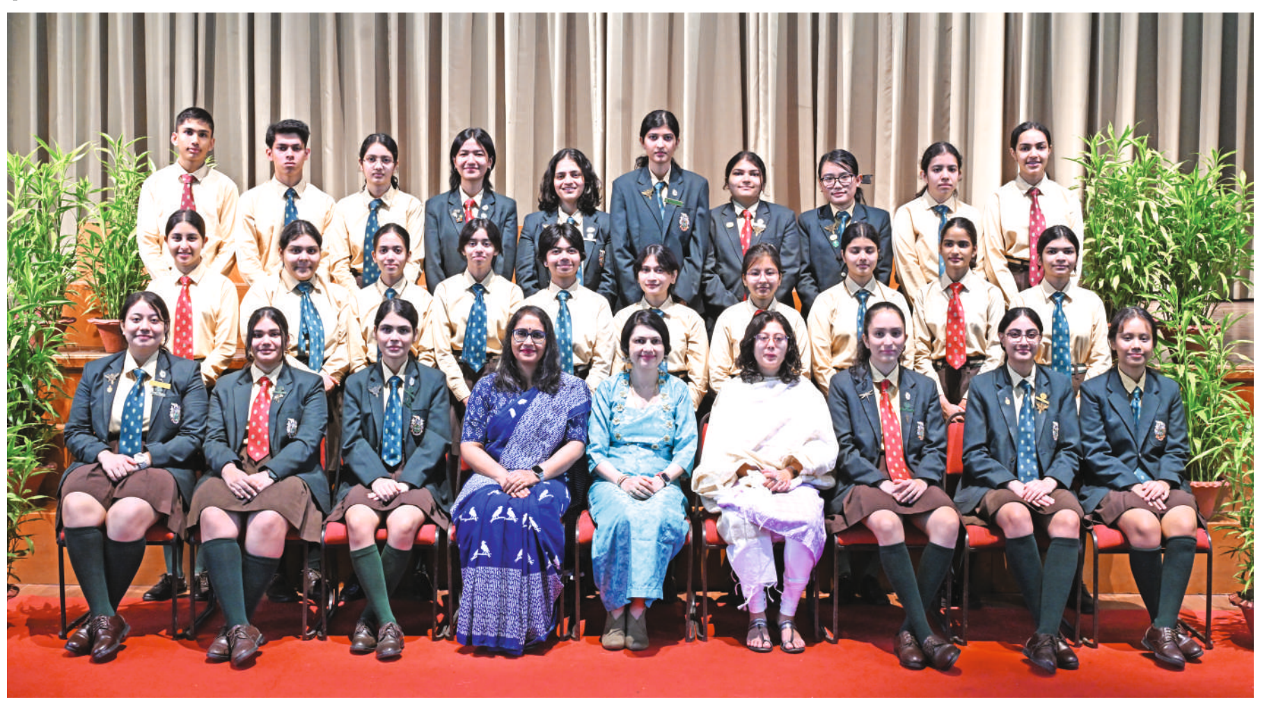
Standing Row 2 (L to R):

IAYP has always been an exciting, educational and adventurous programme by which a student not only learns life skills but becomes a more courageous and adventurous person.