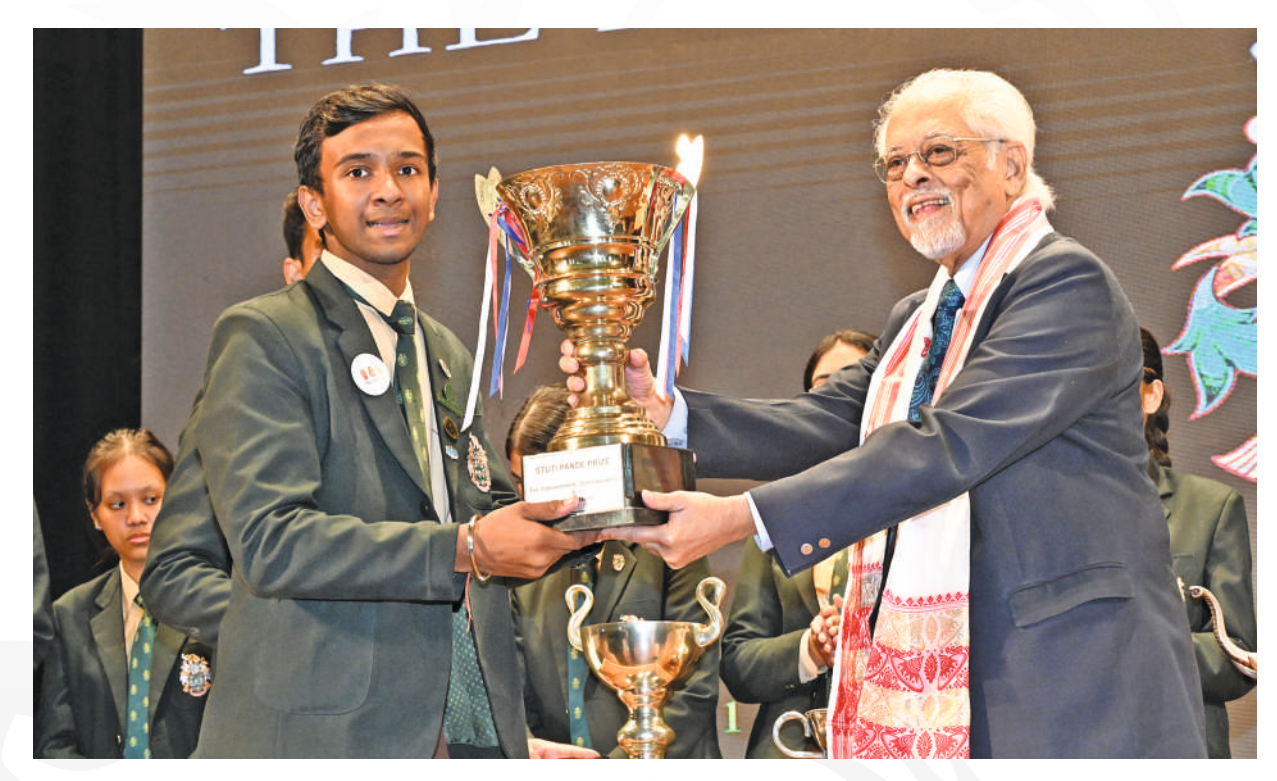
Stuti Pande Award