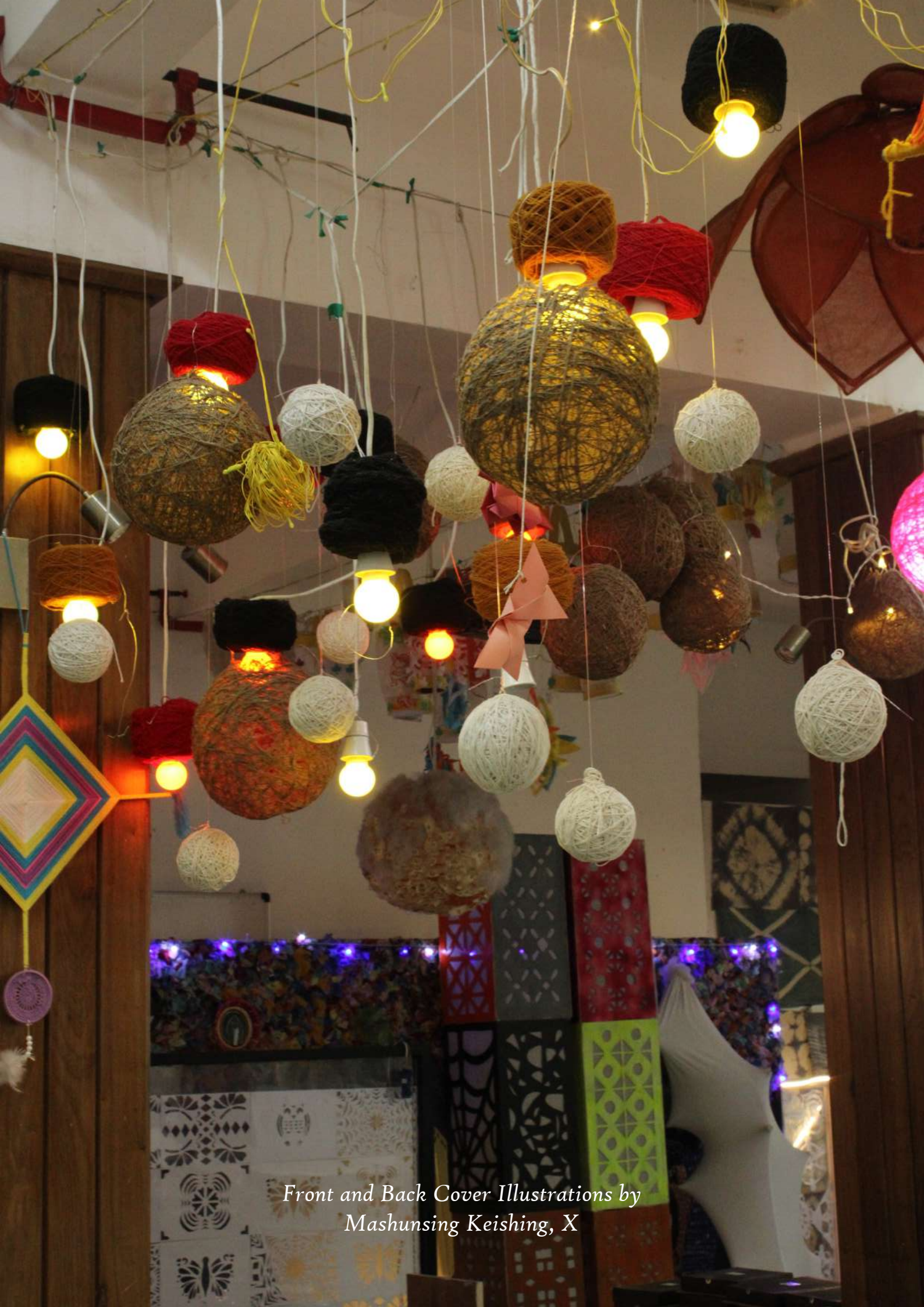
Front and Back Cover Illustrations by Mashunsing Keishing, X